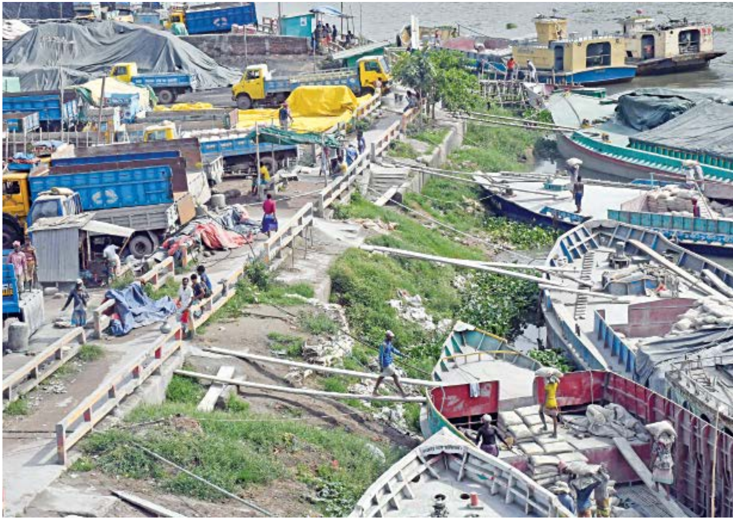
Pedestrians can seldom use the walkway below Amin Bazar Bridge in Savar as anchoring lines of cargo vessels obstruct them. The photo was taken on Friday.