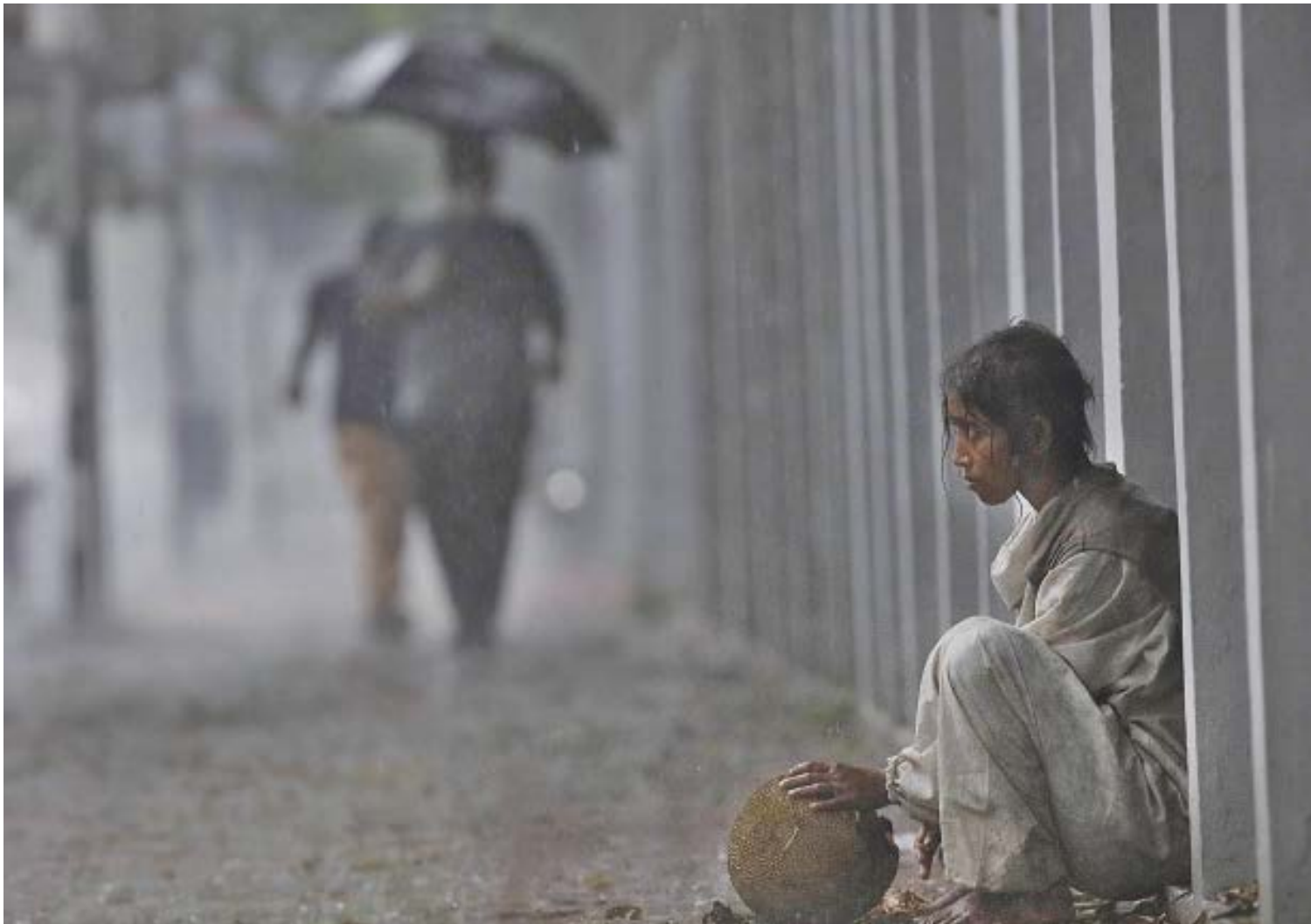
Holding a jackfruit to perhaps eat later, a homeless girl sits under a tree (not in picture) to take shelter from the driving rain yesterday afternoon. The picture was taken on a footpath of a rather empty VIP street in the capital's Bailey Road.

QUAMRUUL ISLAM RUBAIYAT, Thakurgaon Female small entrepreneurs running boutiques in eight northern districts are counting heavy losses after missing out on the year's two most lucrative selling periods due to the Covid-19 shutdown. Many are worried about recovering the capital they invested, which forms a bulk of their year's investment, as they were unable to sell the clothes they had made targeting customers on Pahela Baishakh in April and Eid- SEE PAGE 10 COL 1