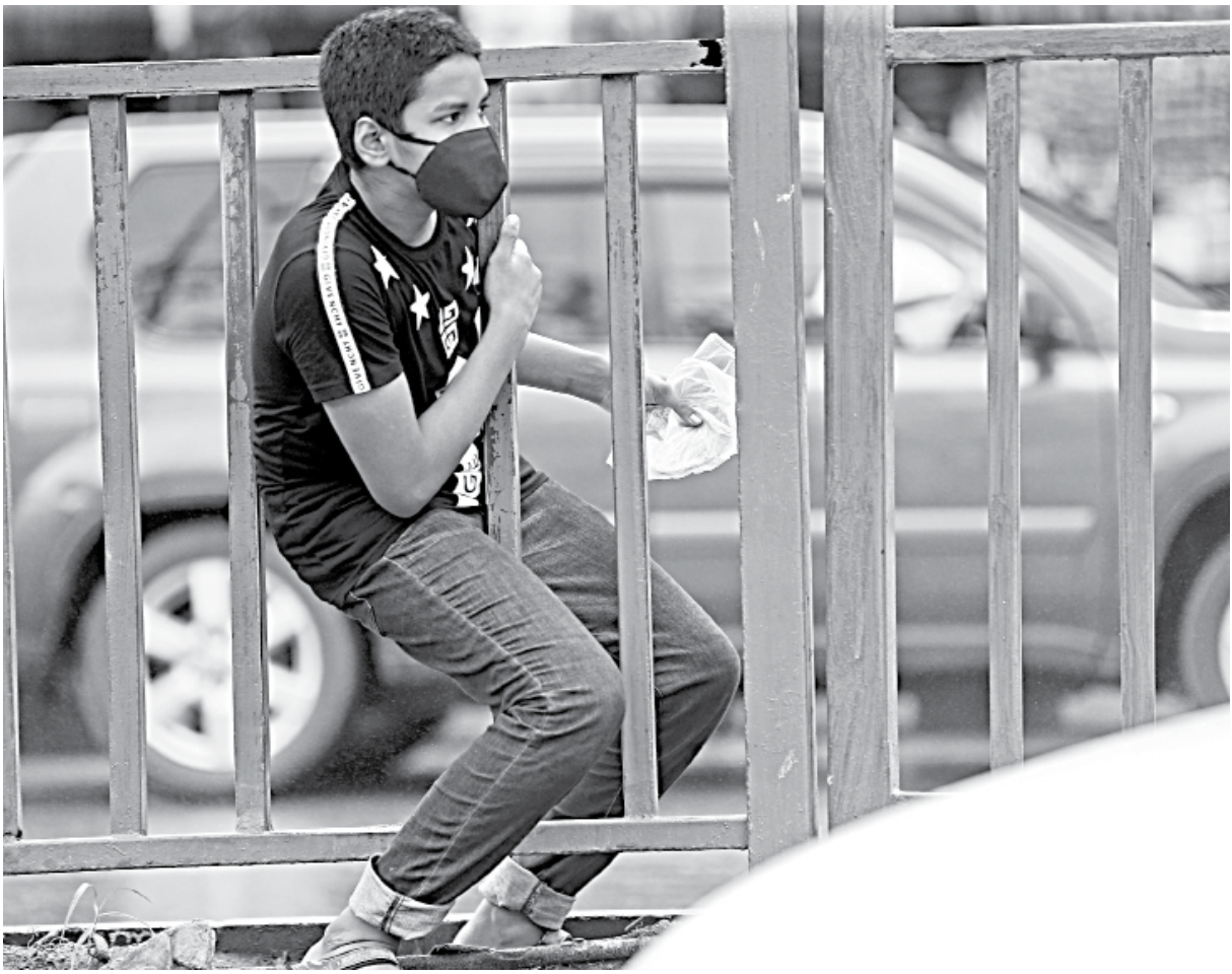
A boy squeezes through a slight extra gap in a divider on Mirpur Road, in front of Chandrima Super Market in the capital, despite there being a footbridge close by. Jaywalking is one of the most common malpractices seen on the streets of Dhaka, and with roads being relatively less packed with traffic, the risk of accidents is higher now than it usually is. The photo was taken last week.

Some of these distribution channels are: District Nursery Owners Associations, Brac, Department of Agriculture Extension and Bangladesh Agriculture Development Corporation, he added.