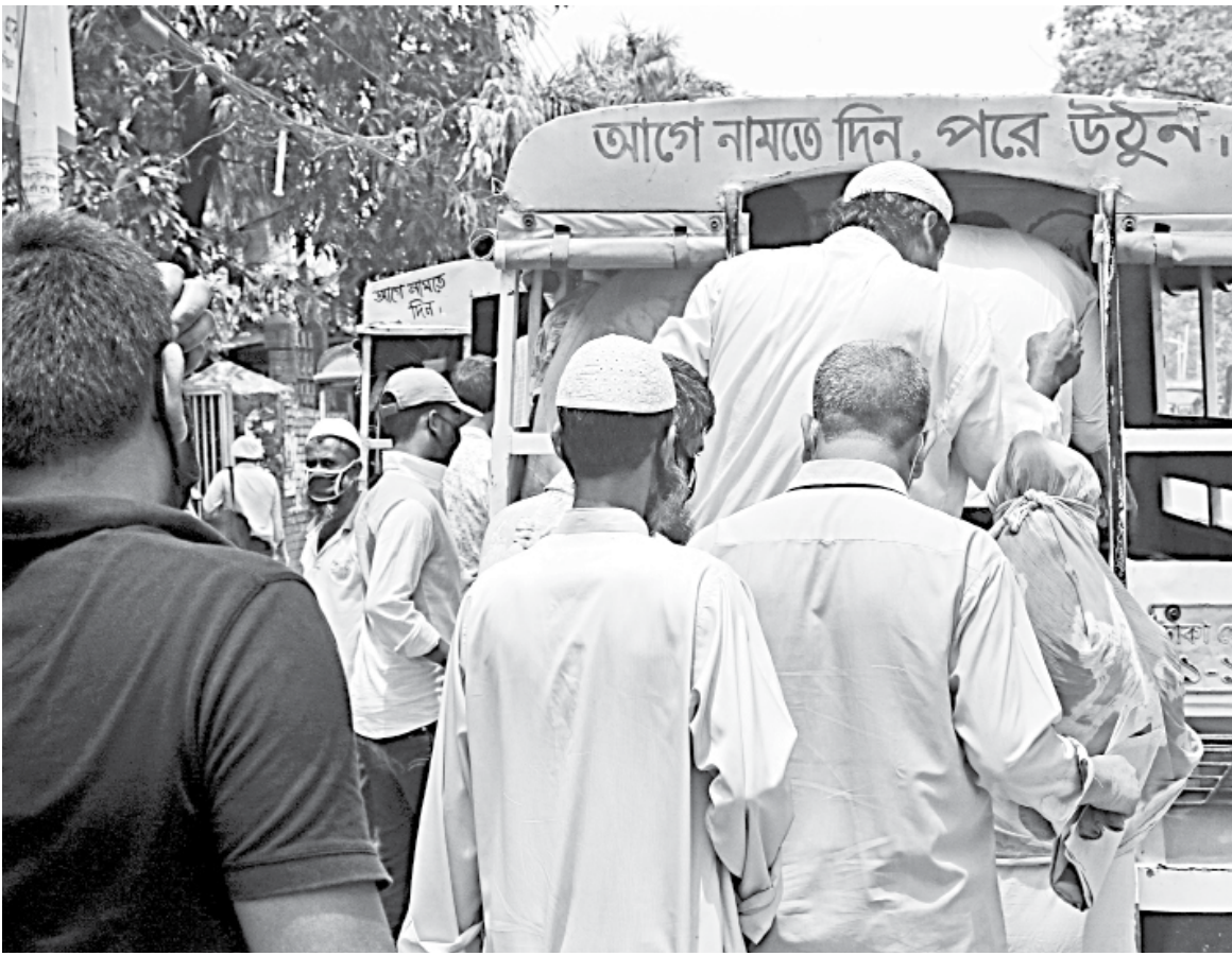
A group of commuters jostle to get on a human haulier in the capital's Gulistan. last week. On one hand, many of these people, who are from low-income backgrounds, are forced to go back to work for their livelihood. On the other, there's an inadequacy of affordable transportation options on the roads, which leads them to cram into the few that are available, forgoing the social distancing advisory issued by authorities to stay safe from the pandemic.