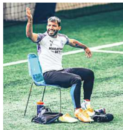
Manchester City striker Sergio Aguero is only four goals away from matching Wayne Rooney as the player with the most goals for a single club in the Premier League era, but his wait may go on longer due to his spotty injury record as he may not be rushed back.

However, the lesson from Germany's Bundesliga, which returned on May 16, is that an increase in injuries is inevitable.