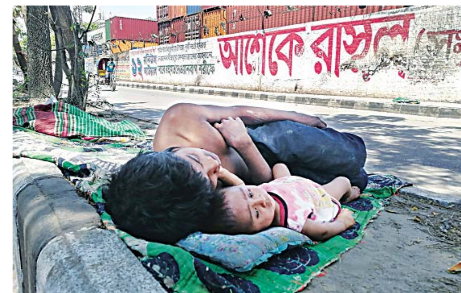
A 12-year-old boy and his four-month-old brother sleep on the central reservation of a street near Kamalapur Internal Container Depot in Dhaka. Their speech-impaired mother left them there to look for food amid the Covid-19 lockdown, sometime in March 2020.