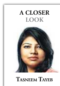
A CLOSER LOOK