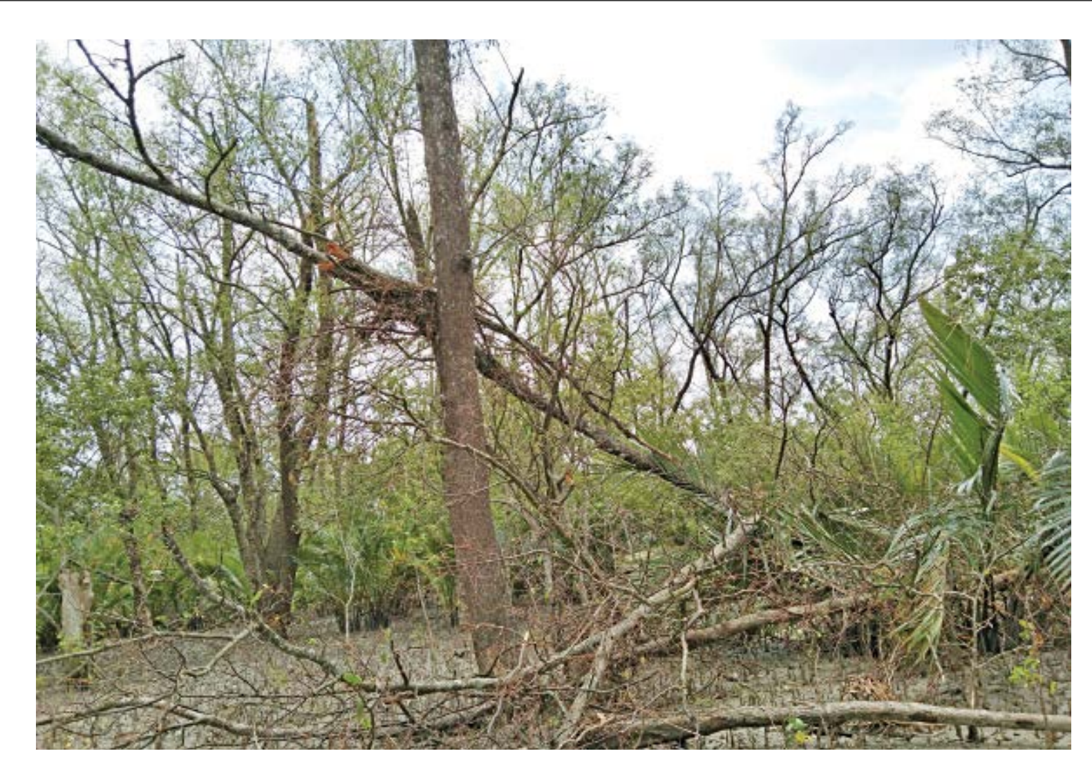
A 9-km stretch of the Nolian forest by Shibsa River in the Sundarbans Khulna range lies badly damaged in the aftermath of Cyclone Amphan, which hit last month. Like every other time, the Sundarbans bore the brunt, sparing large swathes of coastal areas from the wrath of Amphan. The photo was taken recently.

uprooted by Amphan in Khulna and Satkhira ranges of SEE PAGE 10 COL 5