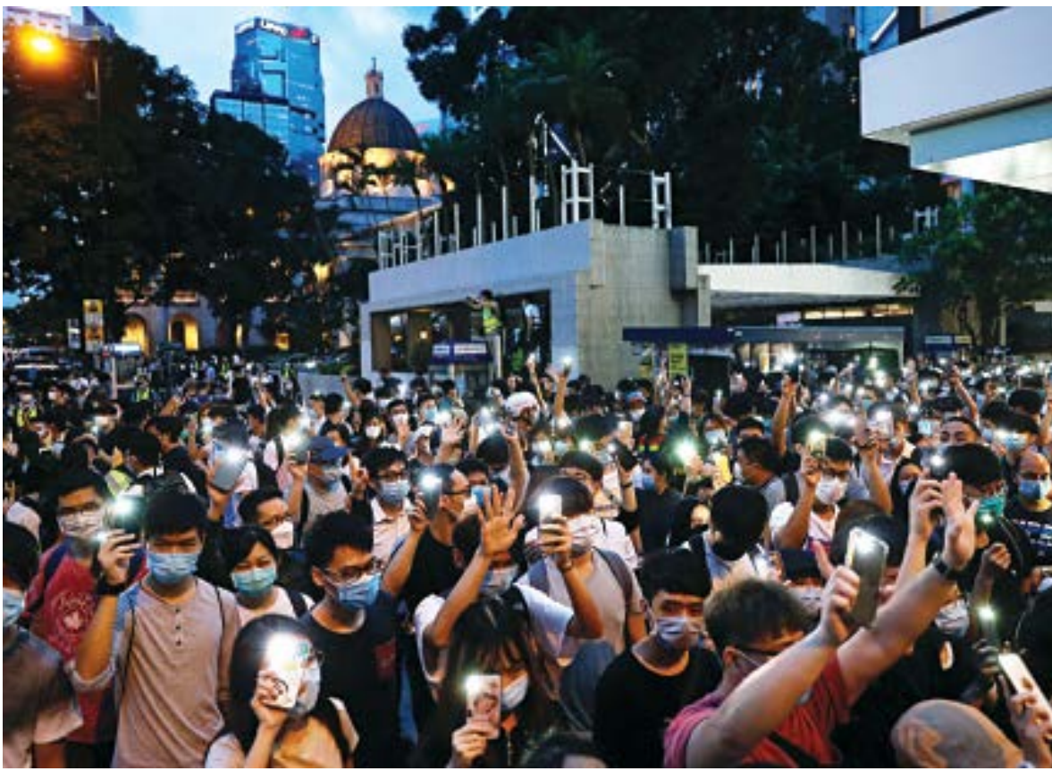
Pro-democracy demonstrators march holding their phones with flashlights on during a protest to mark the first anniversary of a mass rally against the now-withdrawn extradition bill, in Hong Kong, yesterday.

But protests over the last decade have been fuelled by fears those freedoms are being prematurely curtailed, something Beijing denies.