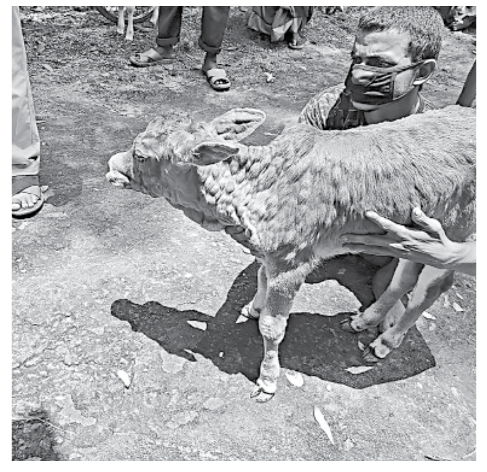
A cattle farmer from Kamarpukur union shows a calf, infected with the lumpy skin disease, at the livestock office in Saidpur upazila recently.

Transmission of LSD occurs via insect vectors and vaccination is the most effective means of control. During the past five years, lumpy skin disease has spread through the Middle East into southeast Europe, the Caucasus, southwest Russia and western Asia. The disease causes substantial losses in affected herds with significant economic consequences. It also blocks access of affected countries to lucrative export markets, compounding the financial impact of an LSD outbreak, the NADIS also said in their website.