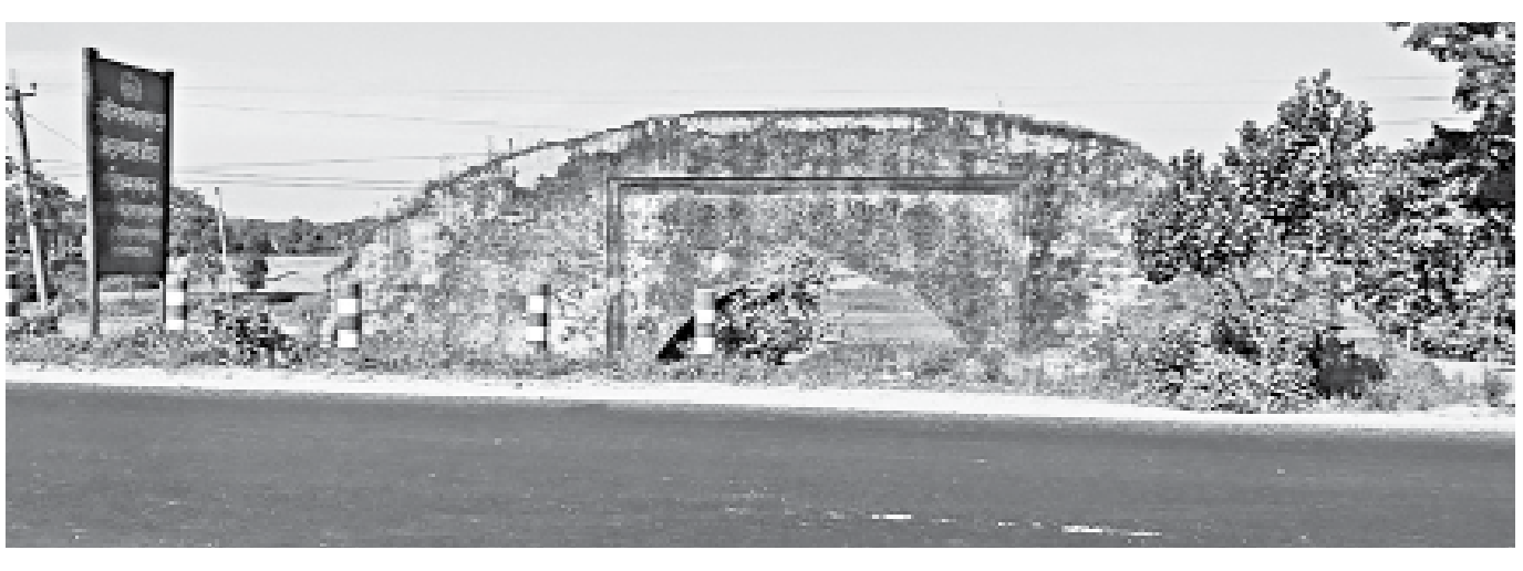
Roadside view of the century old bridge, locally called Hatirpool, on the north side of Dhaka-Sylhet highway at Bariura village in Brahmanbaria's Sarail upazila.

As the road expansion project is now in its initial stage, no final decision has been taken in this regard till now, he said.