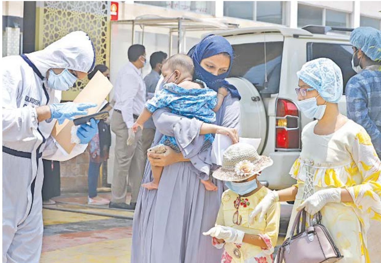
A policeman's wife and her three children come out of Central Police Hospital in the city's Rajarbagh yesterday after giving samples for Covid-19 testing. They were asked to undergo the test as the cop tested positive for the virus a few days ago. A fellow policeman in PPE helping the family get a three-wheeler to take them home.