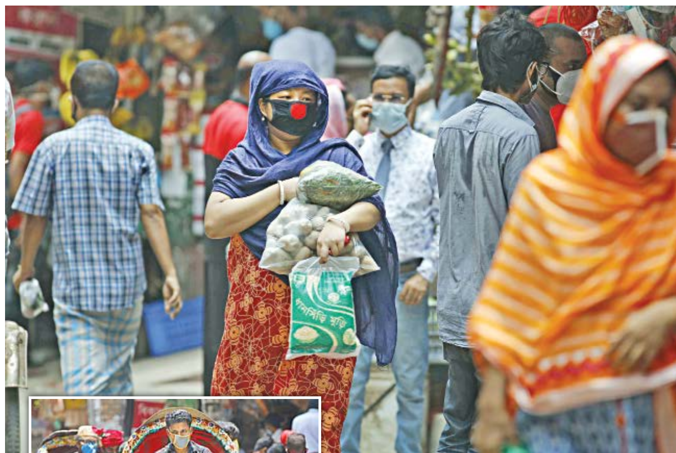
A woman carries groceries to her home in the capital's East Rajabazar yesterday, hours before a lockdown came into force in the area at midnight to stem the spread of Covid-19. Inset, authorities giving health guidelines to locals through loudspeaker.