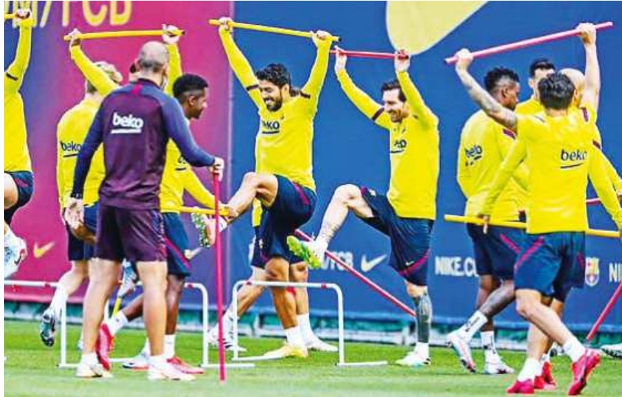
Lionel Messi recovered from a thigh strain and returned to full training yesterday along with Luis Suarez as Barcelona trained in full swing ahead of their match against Mallorca on Saturday.

It has now become obvious that an analyst is an essential tool for a cricketer, and just like batting, bowling and fielding, exposure and utilisation of this resource should now become essential at all levels of the game.