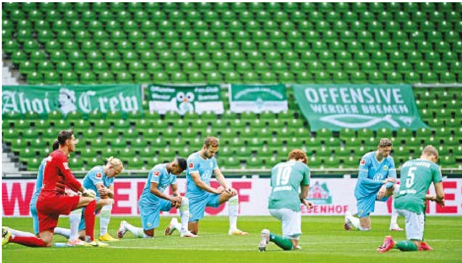
Bundesliga teams continued to show solidarity with protests raging across the US over the death of George Floyd as players of Werder Bremen and Wolfsburg took a knee prior to the start of their match in Bremen on Sunday.