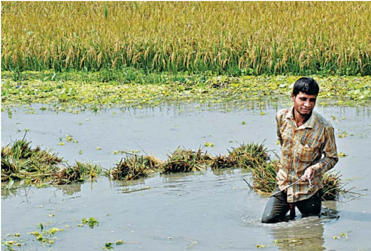
A farmer trying to salvage paddy in a field inundated by rainwater in Sheikh Para area of Rangpur Sadar upazila yesterday. Rain damaged boro paddy on vast swaths of land in and around the area causing losses to farmers.