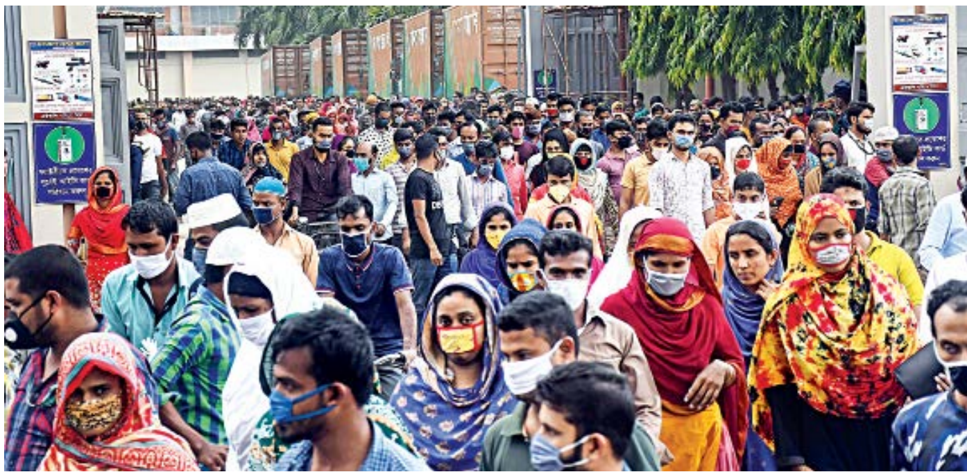
Garment workers are living in constant fear of losing jobs as the pandemic took a toll on export orders. The photo was taken recently from Ashulia on the outskirts of the capital.

central coordination committee featuring buyers, factory owners, union leaders, the Bangladesh Garment Manufacturers and Exporters Association and Bangladesh Knitwear Manufacturers and Exporters Association, to monitor worker termination and misappropriation of funds meant for the industry, the NGWF president said.