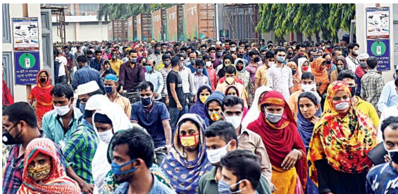
Garment workers are living in constant fear of losing jobs as the pandemic took a toll on export orders. The photo was taken recently from Ashulia on the outskirts of the capital.

central coordination committee featuring buyers, factory owners, union leaders, the Bangladesh Garment Manufacturers and Exporters Association and Bangladesh Knitwear Manufacturers and Exporters Association, to monitor worker termination and misappropriation of funds meant for the industry, the NGWF president said.