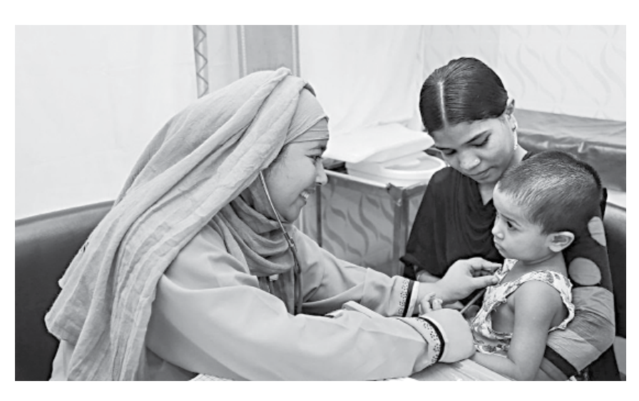
The health sector will require substantial amount of additional funding to respond to the pandemic, but this additional funding must not come at the expense of other critical health services.

Our analysis of government data suggest that overall government hospital admissions have declined by 63 percent over the last few months. This includes a 73 percent decline in the number of patients with acute heart and cardiovascular diseases and more than a 50 percent reduction in patients with kidney failure.