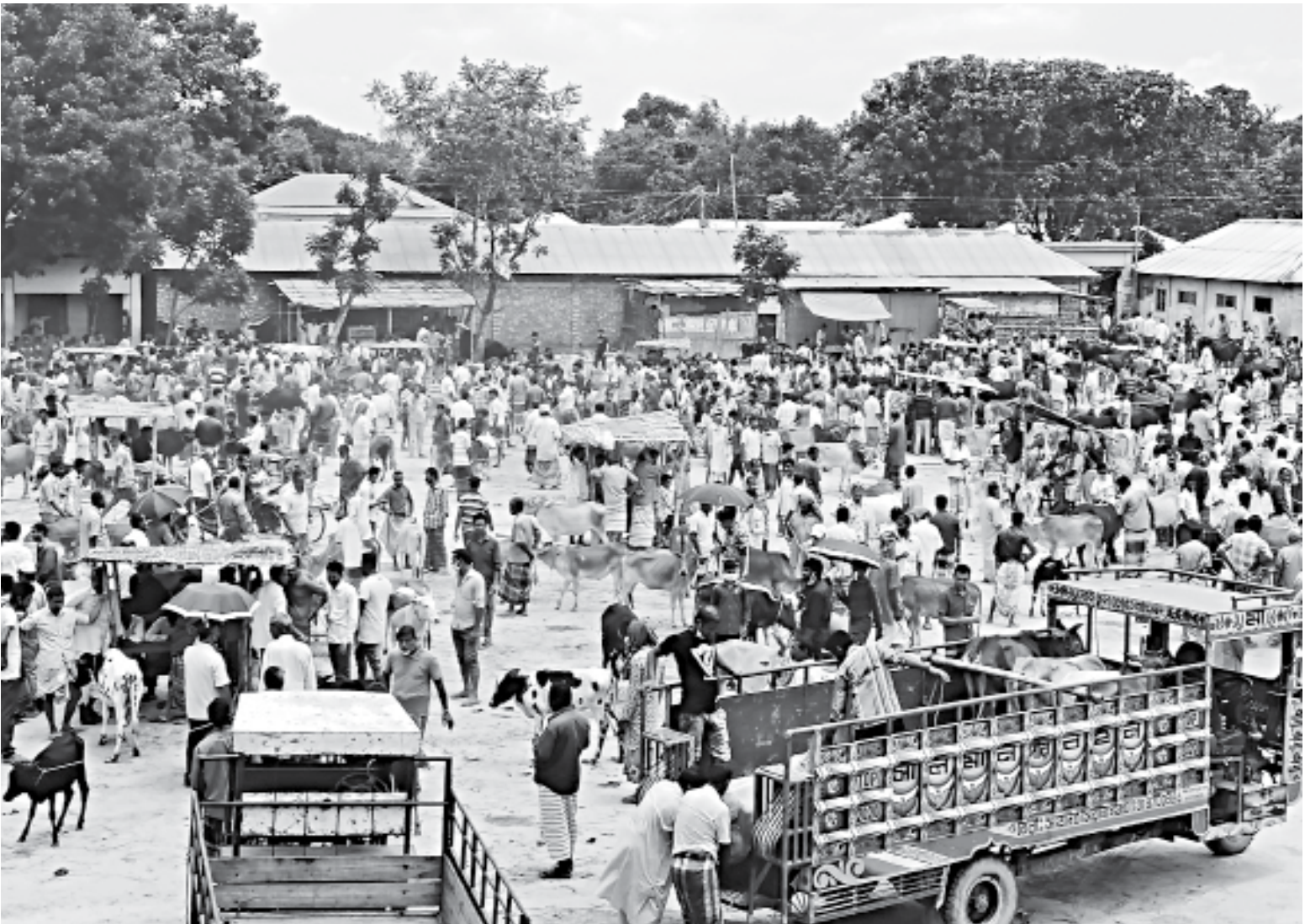
Ignoring the high risk of Covid-19 pandemic, buyers and sellers crowd and move carelessly at Khochabari cattle market in Thakurgaon Sadar upazila.