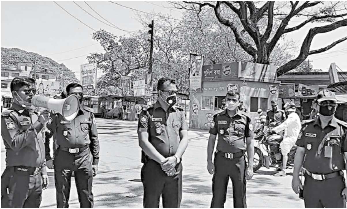
Some police personnel are on duty in Bazar-station road area of Sirajganj Sadar upazila recently. A total of 32 policemen in Sirajganj have been infected with Covid-19 till Saturday.

The SP further said the infected policemen have been put in home quarantine and they are getting treatment under the supervision of the district police administration.