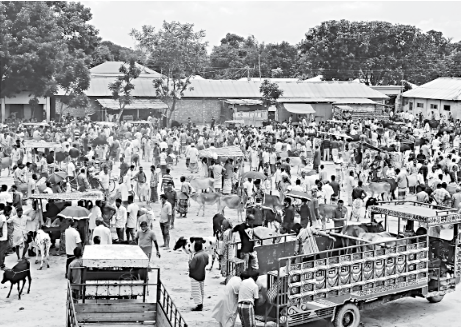
Ignoring the high risk of Covid-19 pandemic, buyers and sellers crowd and move carelessly at Khochabari cattle market in Thakurgaon Sadar upazila.