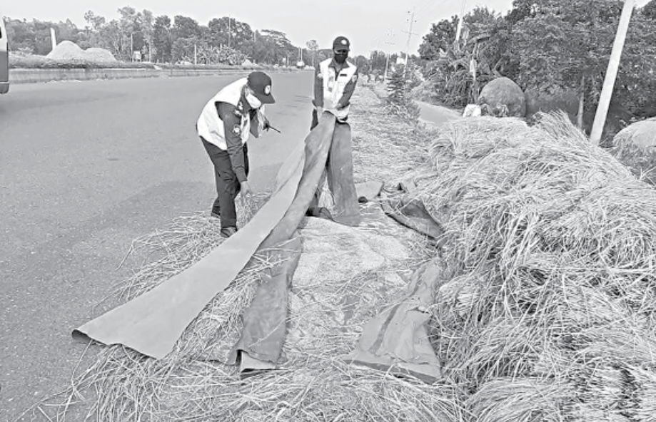
Members of Highway Police remove paddy from Dhaka-Tangail highway in Mirzapur upazila to ensure safe movement of traffic. The photo was taken recently.

The growing practice of drying paddy and straw, occupying parts of Dhaka-Tangail highway in Mirzapur upazila, is turning the vital roadway into a nightmare for vehicular traffic, especially at night. Local Boro paddy farmers are resorting to using the highway and regional roads to dry wet paddy, harvested from submerged paddy fields, as the area lacks elevated paved grounds that would be suitable for drying the produce more conveniently, said locals. Moslem Uddin, a farmer from Charpara in Mirzapur upazila, said, "What can I do? Where can I dry my paddies and straws? I've got no place to dry those at home." "It is quite difficult to carry water-soaked paddies too far after harvesting those from paddy fields inundated with rainwater. So, I am drying my paddies beside the road, not on the road," said another farmer,