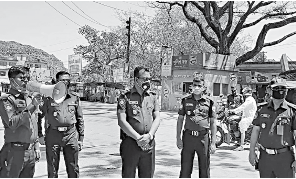
Some police personnel are on duty in Bazar-station road area of Sirajganj Sadar upazila recently. A total of 32 policemen in Sirajganj have been infected with Covid-19 till Saturday.