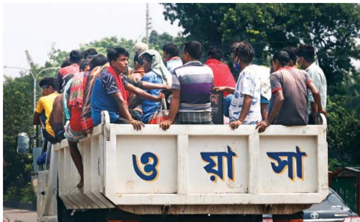
A group of workers crowd on a truck of Dhaka Wasa headed towards Shyamoli in the capital. While some of them are wearing masks, social distancing remains a luxury they cannot afford, and considering the limited Covid-19 testing facilities available in the country, they probably cannot afford to get tested either even if they contract the virus. The photo was taken near Gono Bhaban yesterday.