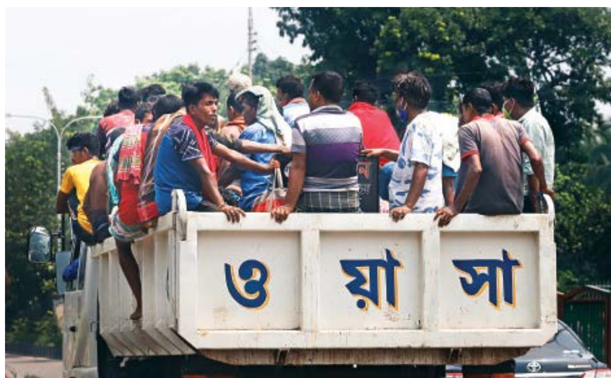
A group of workers crowd on a truck of Dhaka Wasa headed towards Shyamoli in the capital. While some of them are wearing masks, social distancing remains a luxury they cannot afford, and considering the limited Covid-19 testing facilities available in the country, they probably cannot afford to get tested either even if they contract the virus. The photo was taken near Gono Bhavan yesterday.