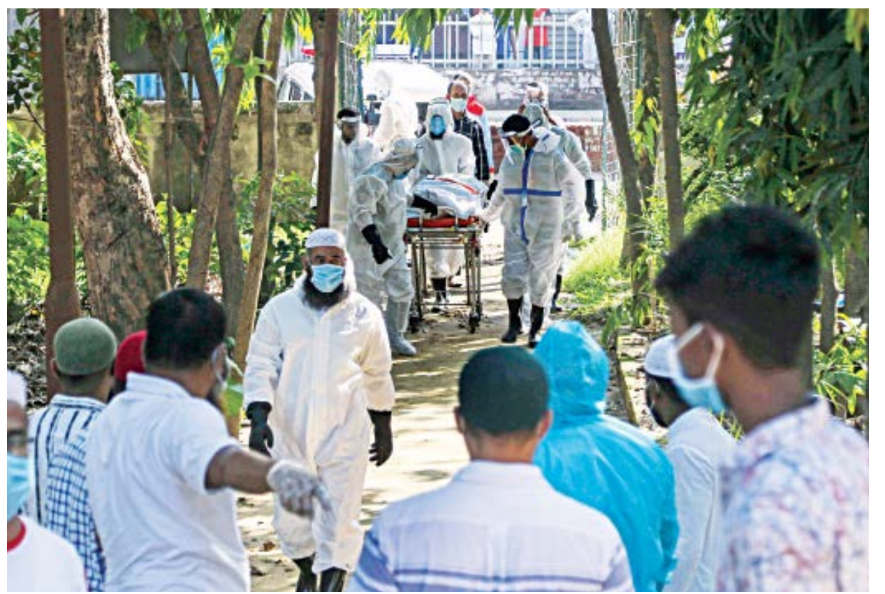
Wearing safety gear, volunteers of Al Manahil Welfare Foundation bring the body of a Covid-19 deceased to a graveyard in port city's Pahartali area for burial.