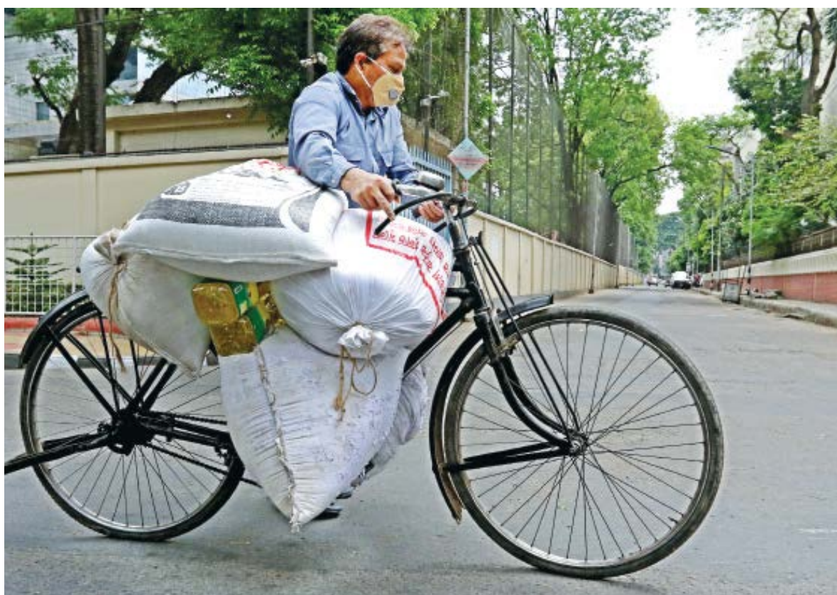
A convenience store owner of Old Dhaka pushes his bicycle loaded with goods bought from Karwan Bazar. Due to restrictions on three-wheelers at some neighbourhoods and streets in the capital, he has to do this laborious task himself. The photo was taken near Matsya Bhaban yesterday.

The steps come amid continued spike in coronavirus cases. SEE PAGE 2 COL 3