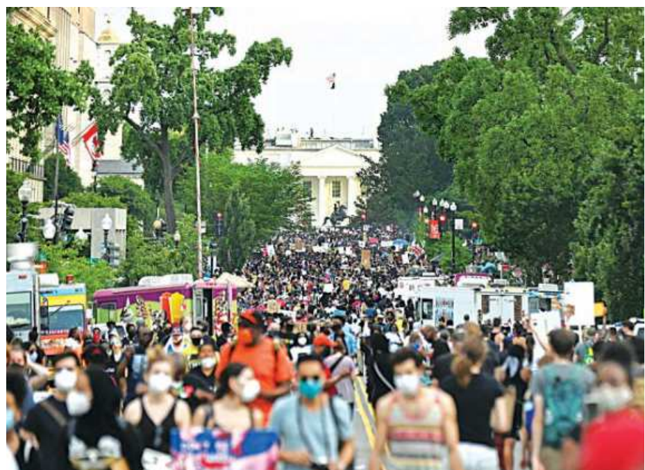
Demonstrators yesterday march on Black Lives Matter Plaza near the White House, during a protest against racial inequality in the aftermath of the death in Minneapolis police custody of George Floyd.