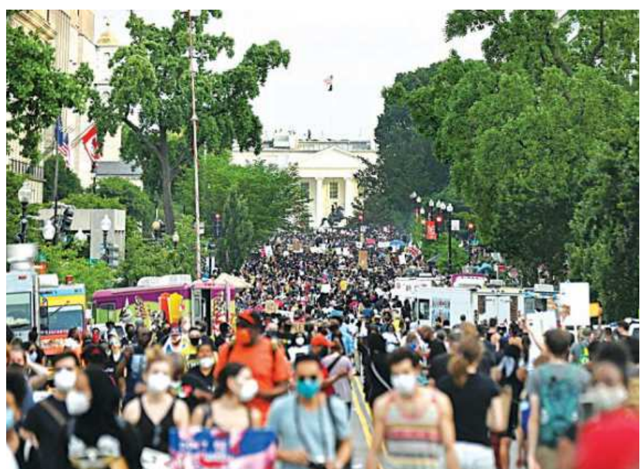
Protesters yesterday march on Black Lives Matter Plaza near the White House, during a protest against racial inequality in the aftermath of the death in Minneapolis police custody of George Floyd.