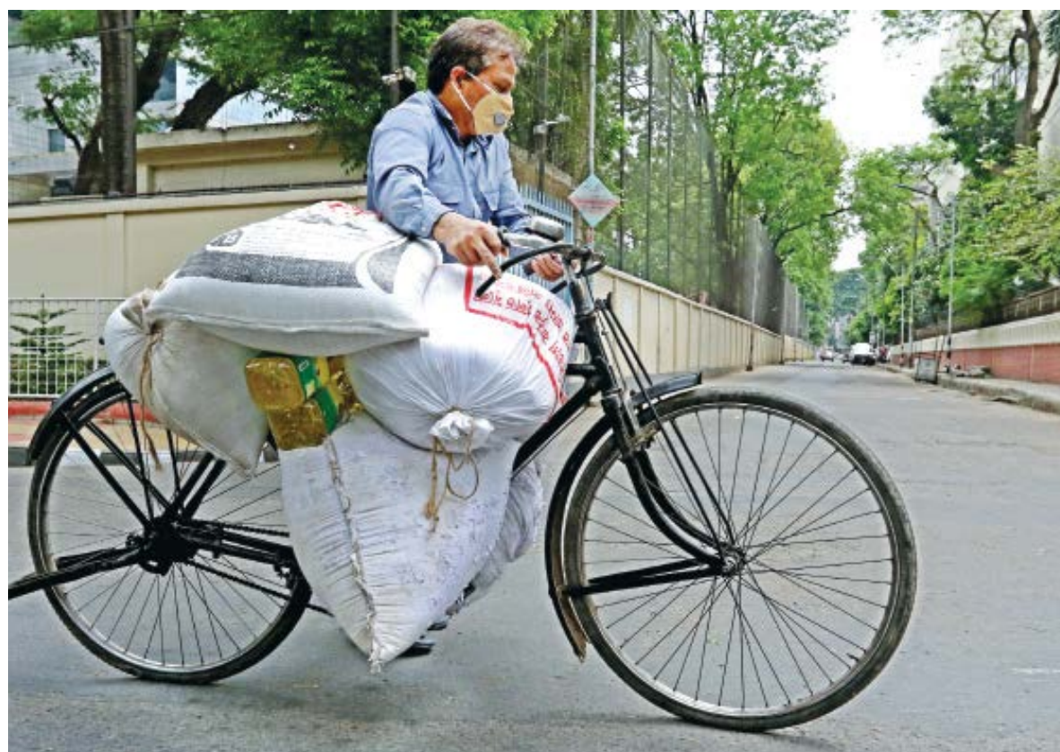
A convenience store owner of Old Dhaka pushes his bicycle loaded with goods bought from Karwan Bazar. Due to restrictions on three-wheelers at some neighbourhoods and streets in the capital, he has to do this laborious task himself. The photo was taken near Matsya Bhaban yesterday.

The steps come amid continued spike in coronavirus cases. SEE PAGE 2 COL 3