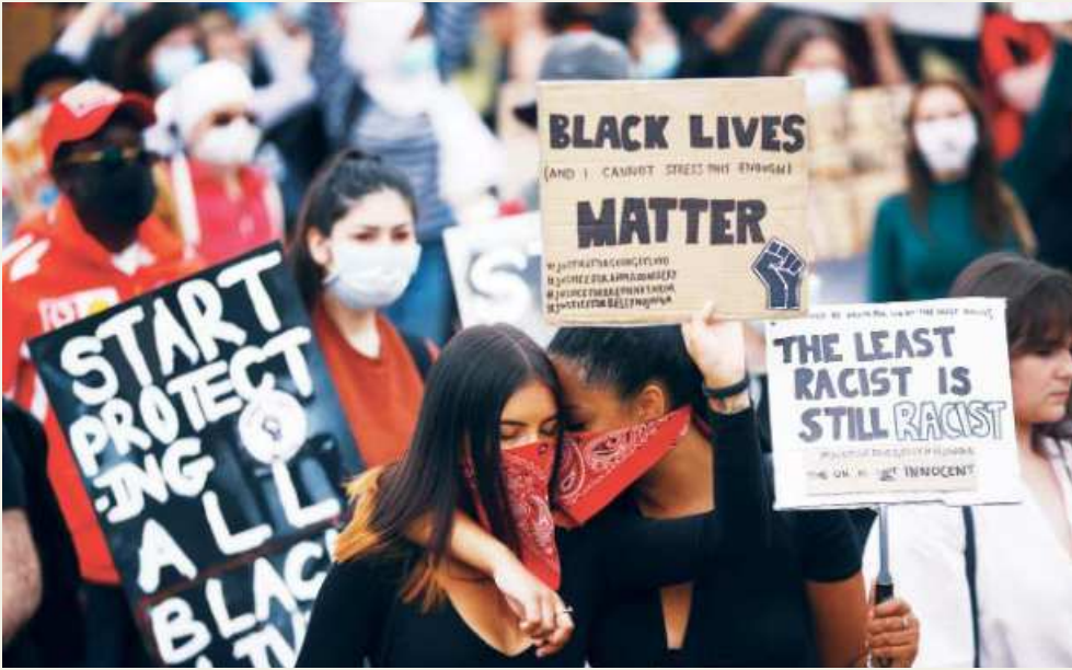
People gather in Hyde Park in London on Wednesday during a "Black Lives Matter" protest following the death of an Afro-American man in police custody in US.

Former president George W Bush called on the US to take a hard look at its "tragic failures". "It remains a shocking failure that many African Americans, especially young African American men, are harassed and threatened in their own country," Bush said in the statement. "This