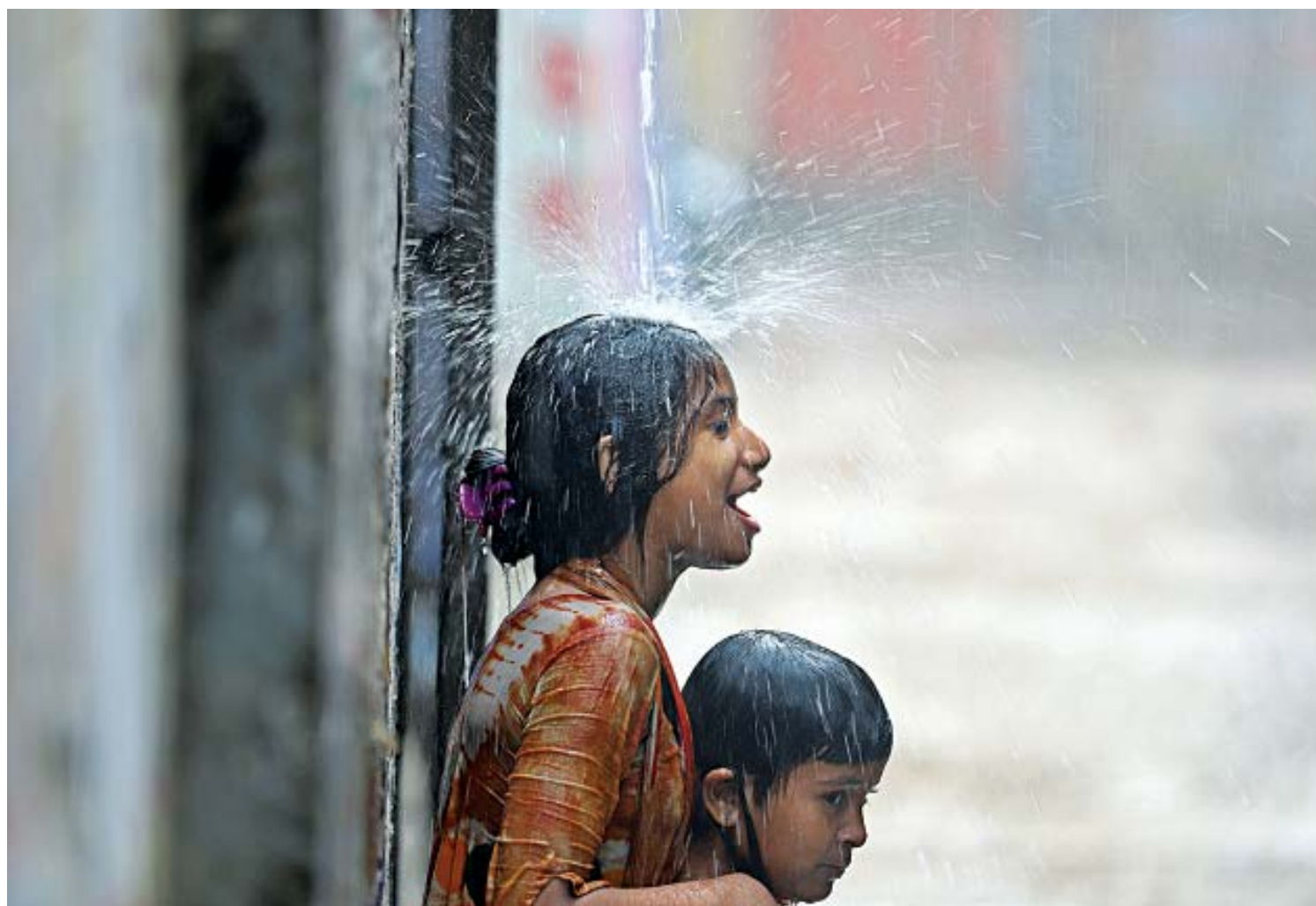
Two children enjoying the sweet relief brought by the rain yesterday after Dhaka suffered a few days of extreme heat and humidity. The photo was taken yesterday at Mugdapara.