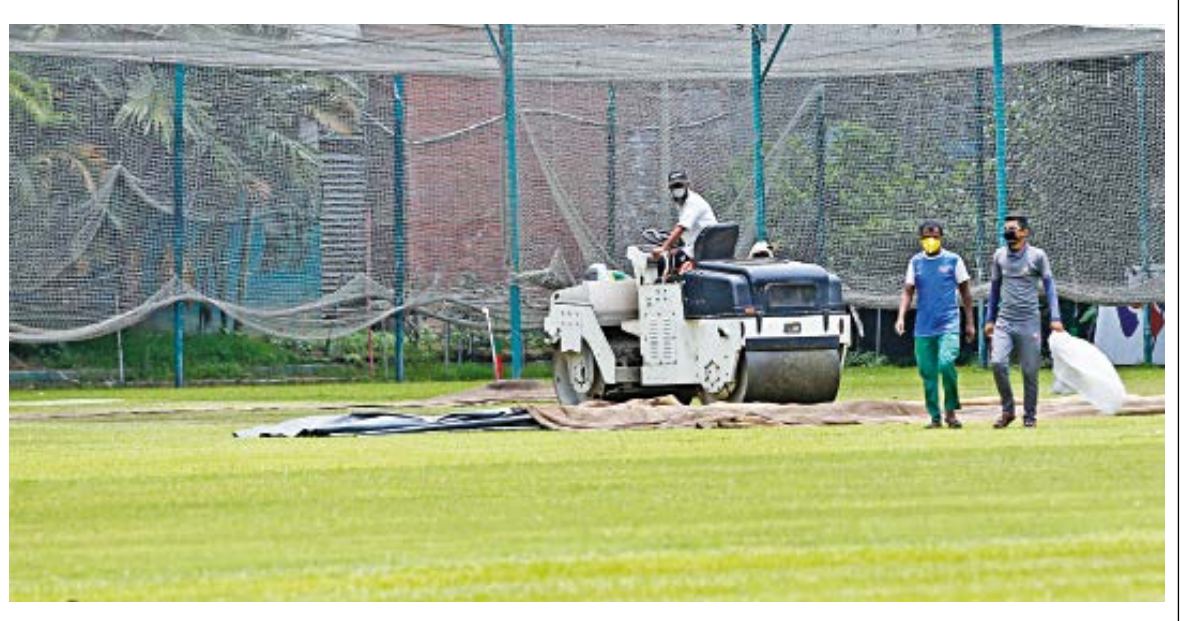
Unlike most other sports in the country, cricket is gearing up for a potential restart, even if in the form of training. The BCB Academy ground is being prepared as the BCB is contemplating plans to start training while maintaining safety regulations.

"We have no alternative but to scrap maximum international tournaments proposed for Mujib Borsho as health and safety is our