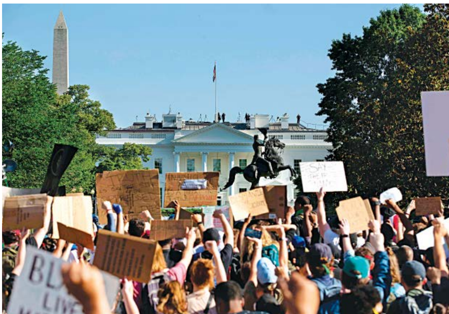
Demonstrators hold up placards and protest outside the White House in Washington DC yesterday. President Donald Trump vowed Monday to order a military crackdown on violent protests gripping the United States.