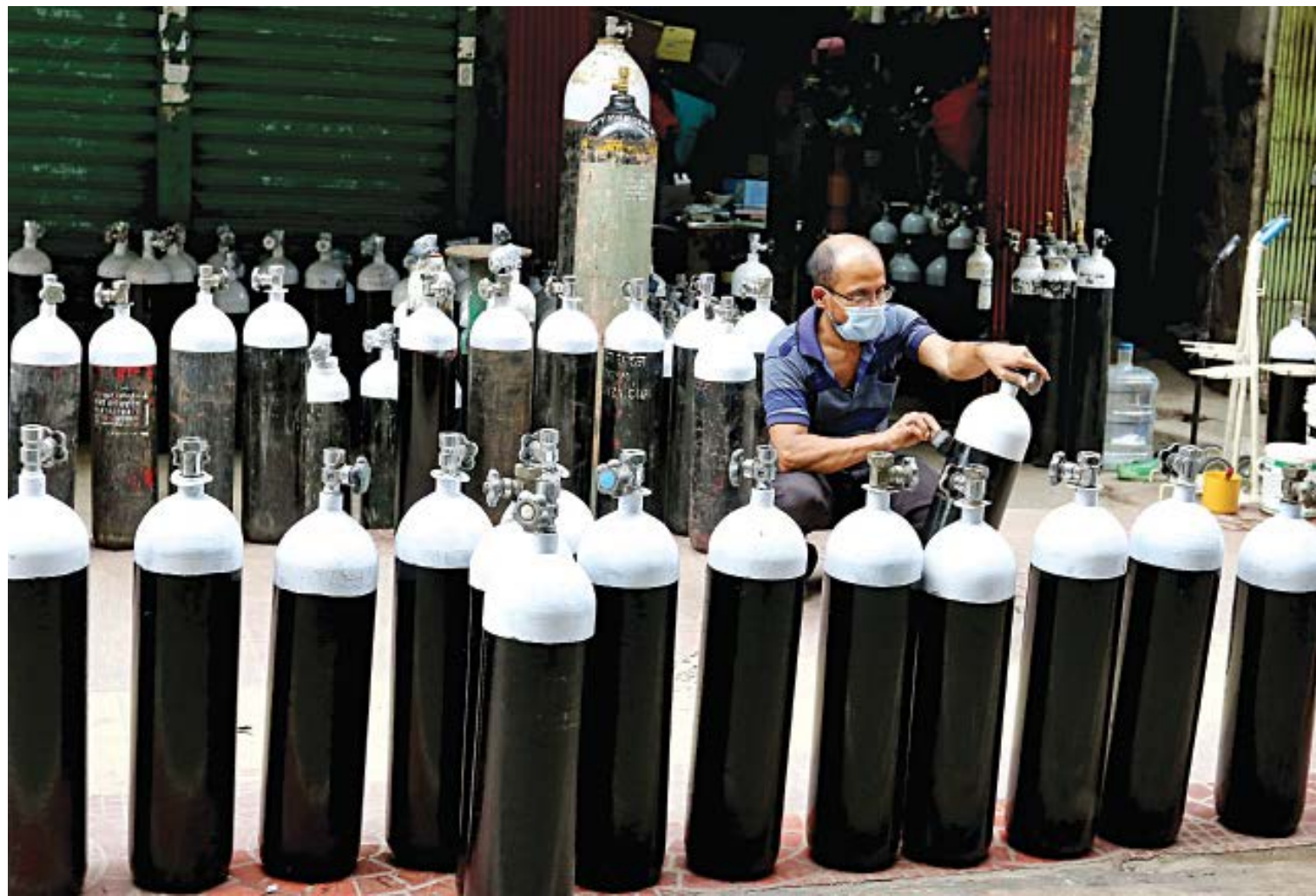
A worker paints an oxygen cylinder outside a shop on Tongi Diversion Road in the capital's Moghbazar area yesterday. With the number of Covid-19 patients on the rise in the country, the demand for such cylinders is going up. The shop rents out each filled cylinder for Tk 1,000 a day.