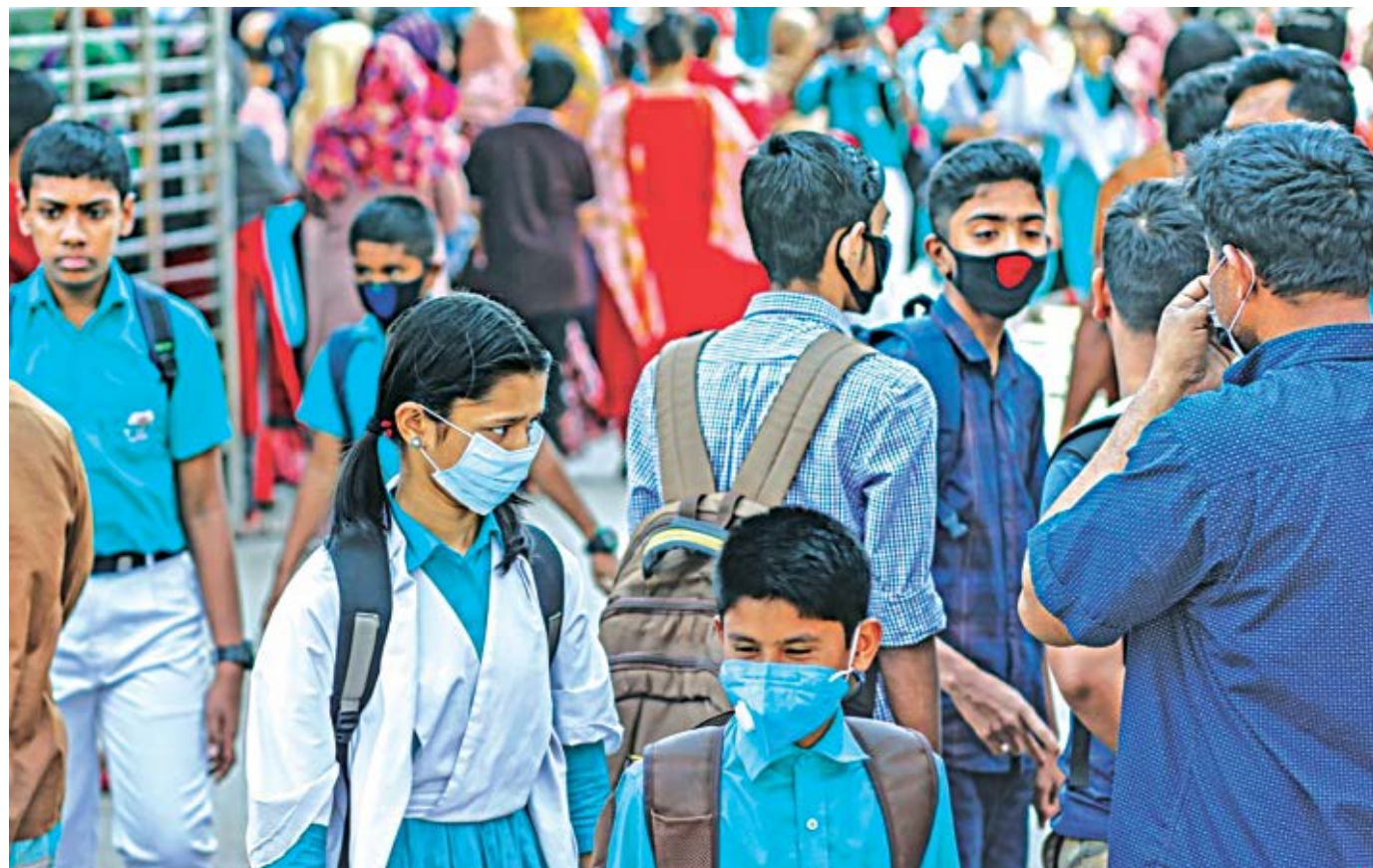
A three year education recovery plan is needed to protect the recent progress and prevent setting back children's education due to the pandemic's impact.