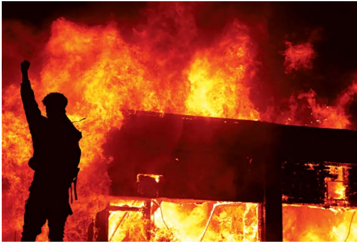
A protestor gestures in front of a burning shop during a demonstration against the death in Minneapolis police custody of African-American man George Floyd, in Minneapolis, Minnesota, early yesterday.

Trump said in his tweet: "These THUGS are dishonoring the memory of George Floyd, and I won't let that happen. Just spoke to Governor Tim Walz and told him that the Military is with him all the way. Any difficulty and we will assume control but, when the looting starts, the shooting starts. Thank you!"