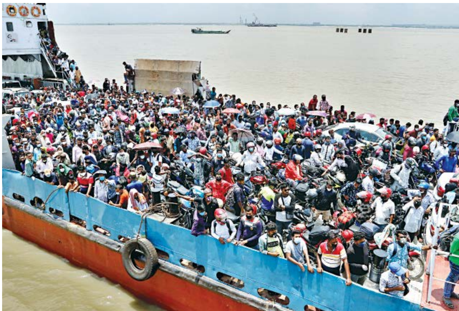
Crammed with people bound for Dhaka, a ferry reaches Shimulia Ferry Terminal in Munshiganj yesterday. With movement of public transport suspended, thousands are returning to their workplaces using different modes of transport after celebrating Eid at their village homes. Travelling like this is putting people at risk of contracting Covid-19.