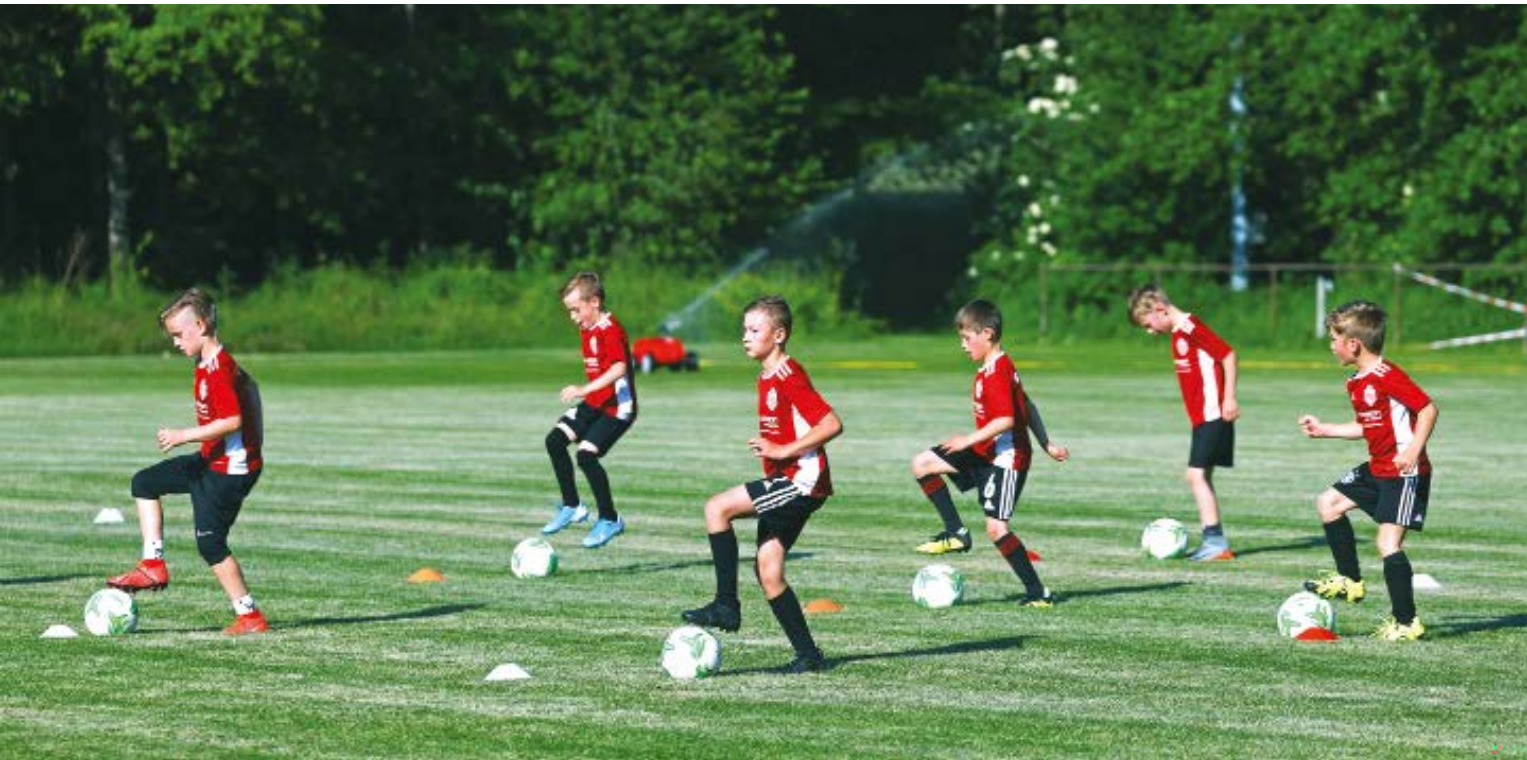
Young footballers in Germany returned to business almost two weeks after the top-flight Bundesliga resumed. Members of the youth football department of Kickers Horlofftal are seen here in Reichelsheim on Wednesday in their first training session since the lockdown.