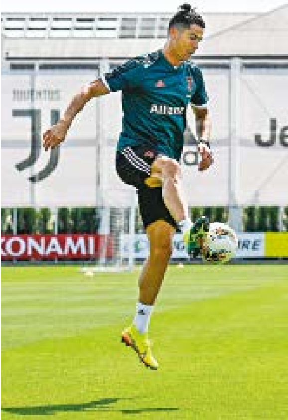
Juventus superstar Cristiano Ronaldo was working on his conditioning in an individual training session, eager to get back into the swing of things as a government decision on the fate of Serie A was due to be announced Thursday.