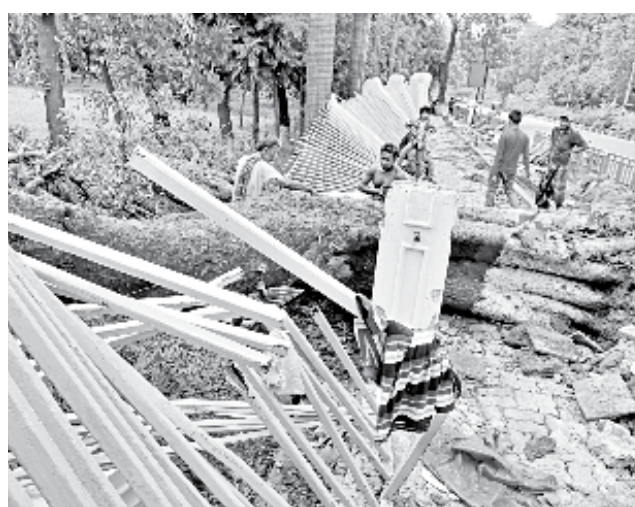
A thunderstorm in the early hours of yesterday left two large trees along the High Court uprooted, damaging a part of the metal fencing and its concrete pillars in the process. The photo was taken yesterday morning.