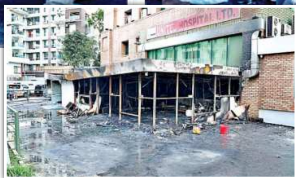
CID officials inspect charred remains at the isolation coronavirus unit of the capital's United Hospital yesterday. Inset, the temporary unit, which was set up outside the hospital's main building. Five patients being treated at the unit were killed after a devastating fire broke out there on Wednesday night.