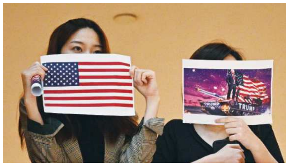
Two women hold up posters of the US flag and a depiction of President Donald Trump during a rally in a shopping mall in Hong Kong yesterday, as the city's legislature debates over a law that bans insulting China's national anthem.