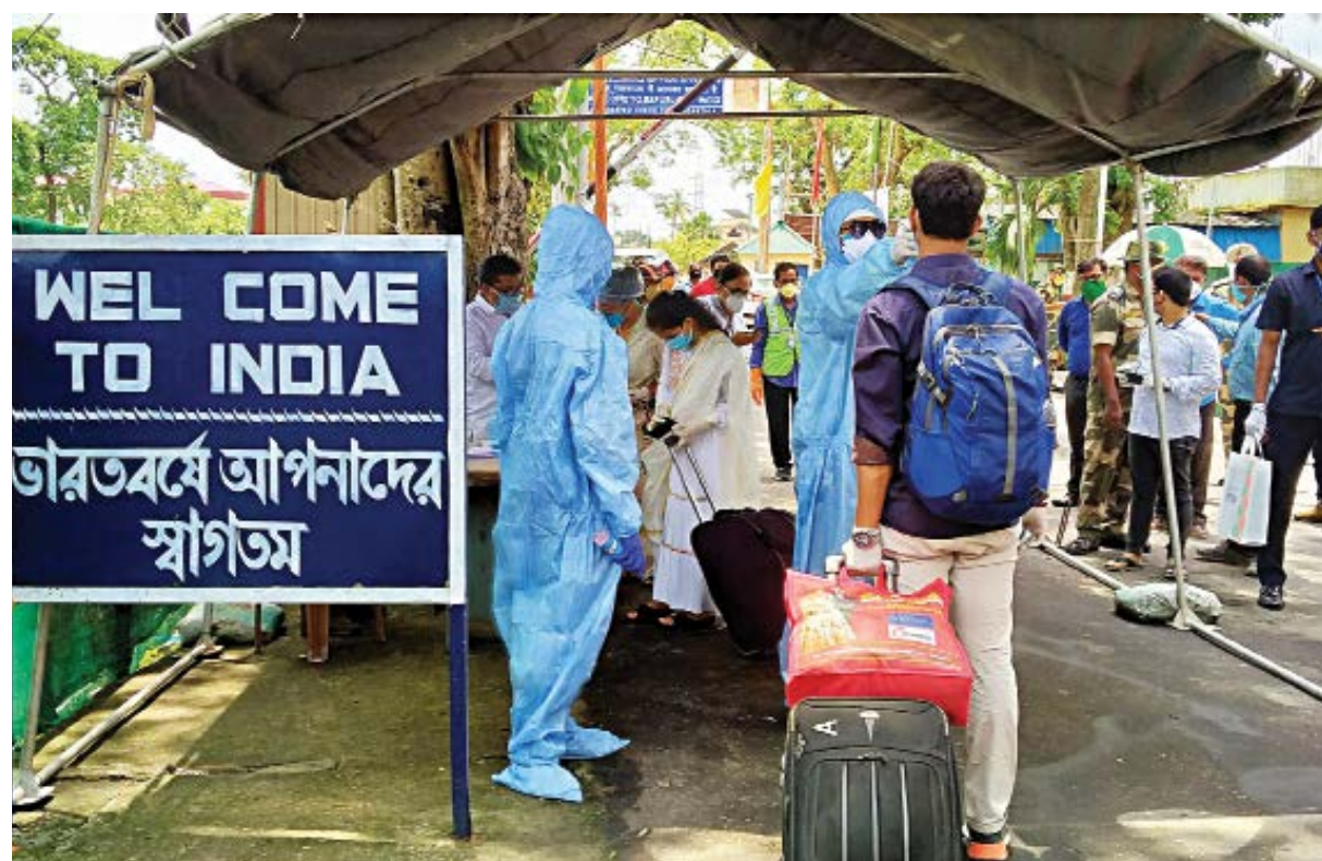
More than one hundred Indian citizens, who had remained stranded in Bangladesh for over two months due to Covid-19 pandemic, returned to their country through Akhaura international immigration check post in Brahmanbaria yesterday.