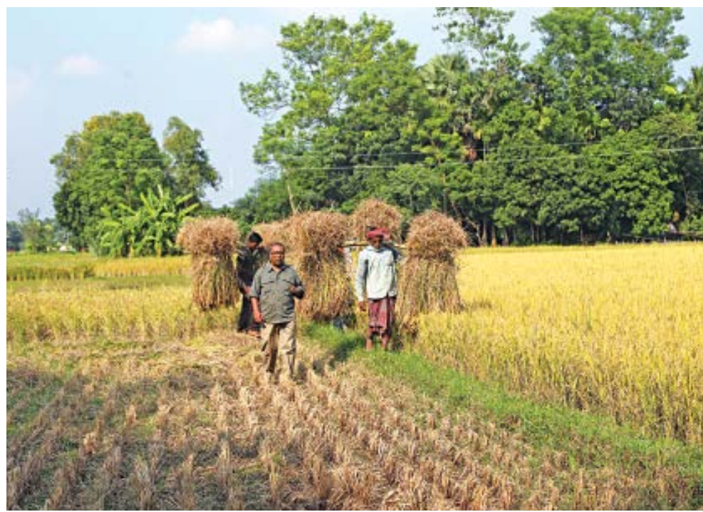
Shykh Seraj talks with a farmer, maintaining safe distance.