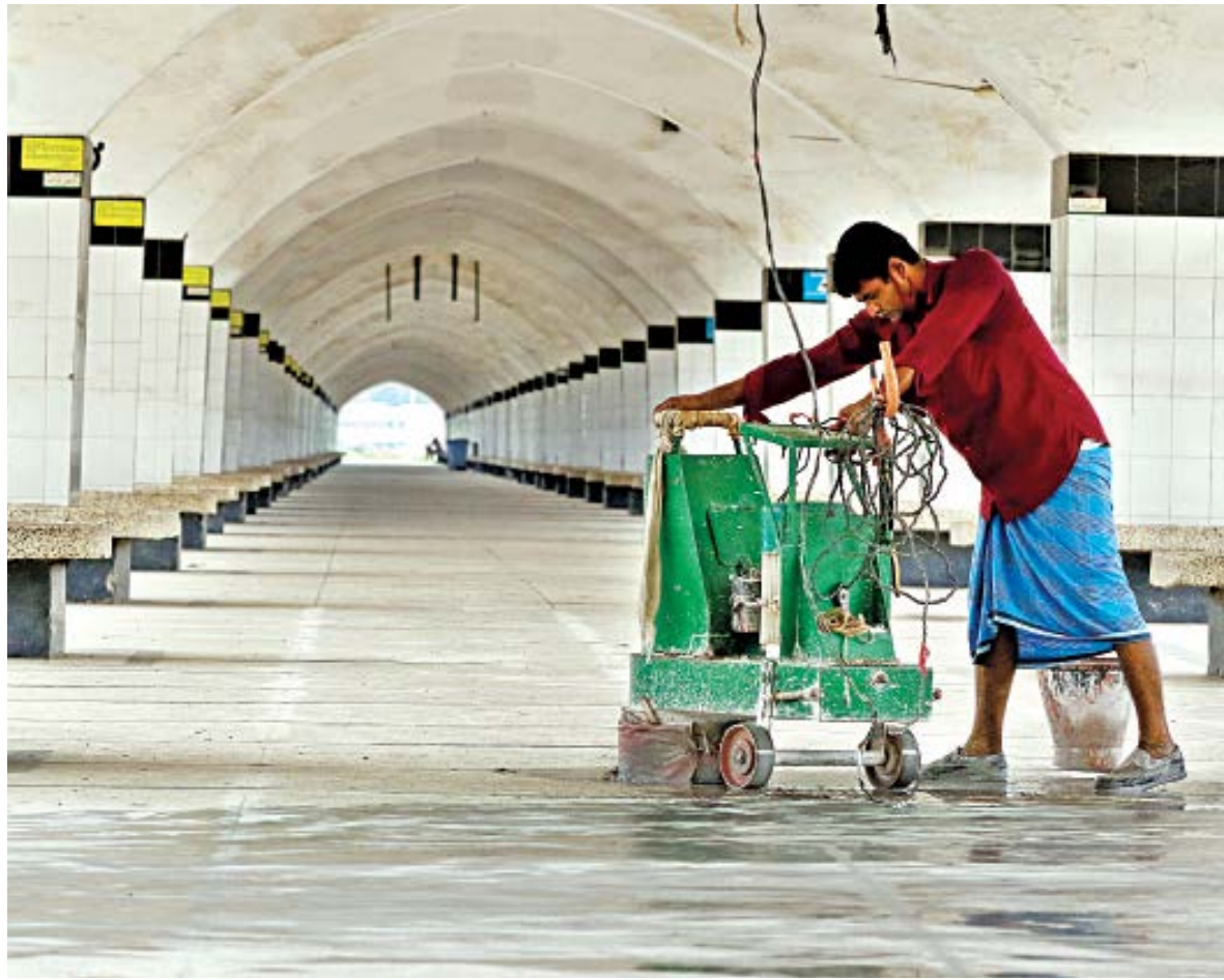
Kamalapur Railway Station in the capital being cleaned and prepped yesterday, ahead of the reopening of inter-city train routes on Sunday. The station will be busy with passenger activity after over two months, although fewer people will travel in every train as part of measures to ensure social distancing amid the Covid-19 outbreak.