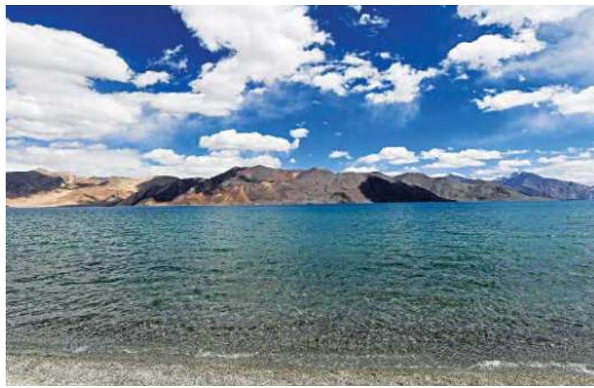
This photo taken on September 14, 2018, shows a general view of the Pangong Lake in Leh district of Union territory of Ladakh bordering India and China.

building of a new runway suitable for warplanes. In response, the Indian army has moved several battalions from an infantry division usually based in the Ladakh city of Leh to "operational alert areas" along the border, and reinforcement troops have been brought in, reported The Guardian. On Tuesday, Indian Prime Minister Narendra Modi held talks with the three services chiefs and the National Security Adviser amid the worst India-China border tensions since the 2017 Doklam standoff that continued for 73 days. On the same day, Chinese President Xi Jinping ordered the military to scale up its battle preparedness, visualising the worst-case scenarios and asked them to resolutely defend the country's sovereignty. He however did not mention any specific threat. Though US President Donald Trump on Wednesday offered to mediate the standoff, both India and China have traditionally opposed any outside