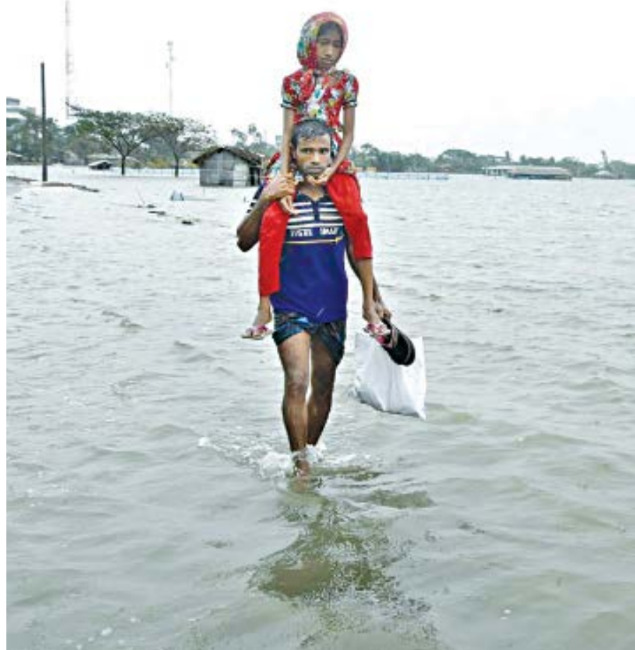
A man carries a child on his shoulders on an inundated road to higher grounds in Koyra upazila of Khulna yesterday. The Horinkhola embankment was destroyed by Amphan resulting in many villages getting flooded.