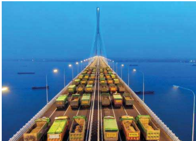
This aerial photo taken on Wednesday shows trucks driving on the Hutong Yangtze River Bridge during a load test in Nantong, in China's eastern Jiangsu province.