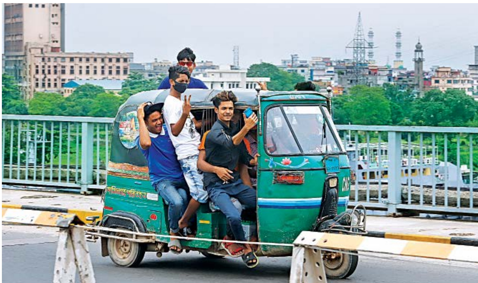
Precariously positioned on a moving auto-rickshaw, sitting on each other's laps and clicking selfies for the social media, this large group of friends were spotted while crossing the Postogola bridge yesterday. While the shortage of transport have been a problem for some commuters, there is no excuse for choosing to be reckless, especially at a time when roads are empty and susceptible to accidents.