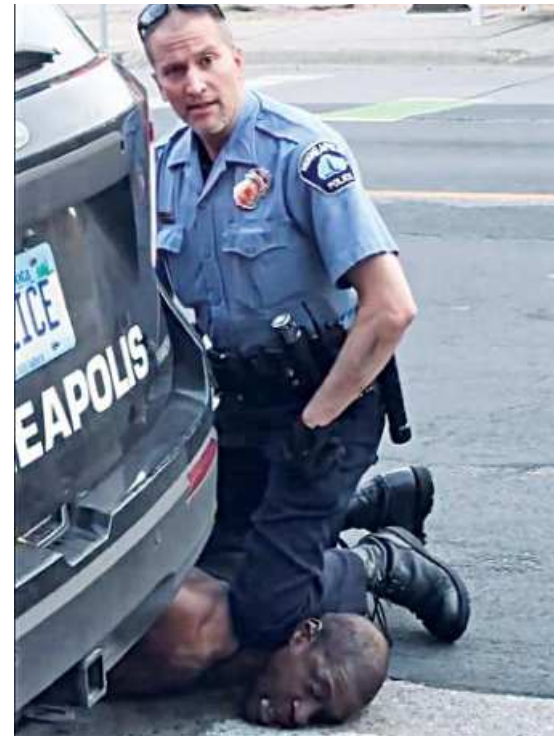
(From top, anti-clockwise) Police use pepper spray as protesters demonstrate against the killing of a African-American man in Minneapolis, Minnesota, on Wednesday; demonstrators react in front of police in downtown Los Angeles; a group of protesters in Minneapolis demonstrate; a shop burns in Minneapolis; and a still image from a video shows a police officer on Monday arresting George Floyd, whose death sparked the protests.