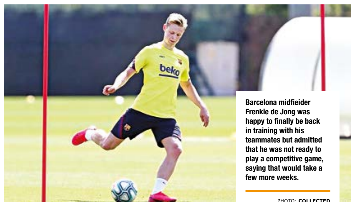
Barcelona midfielder Frenkie de Jong was happy to finally be back in training with his teammates but admitted that he was not ready to play a competitive game, saying that would take a few more weeks.

"He is a controller, you should not ask him to score 20 goals, he is not such a player. I am sure he will be a great successor to Busquets in the future."