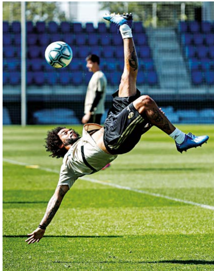
With La Liga ideally less than a month from potential restart, Real Madrid stars, including Sergio Ramos (L) and Marcelo, were sweating it out in training, trying to perfect their bicycle-kick skills.