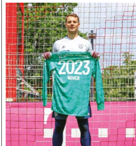
Bayern Munich goalkeeper Manuel Neuer poses with a team jersey and the number 2023, indicating the year until which he recently extended his contract. Meanwhile, Borussia Dortmund forward Erling Braut Haaland was all smiles as he aims to continue his scoring streak.

Star Sports Select 2 Borussia Dortmund v Bayern Munich Live from 10:30pm Werder Bremen v Borussia M'gladbach Live from 12:30am (Wednesday)