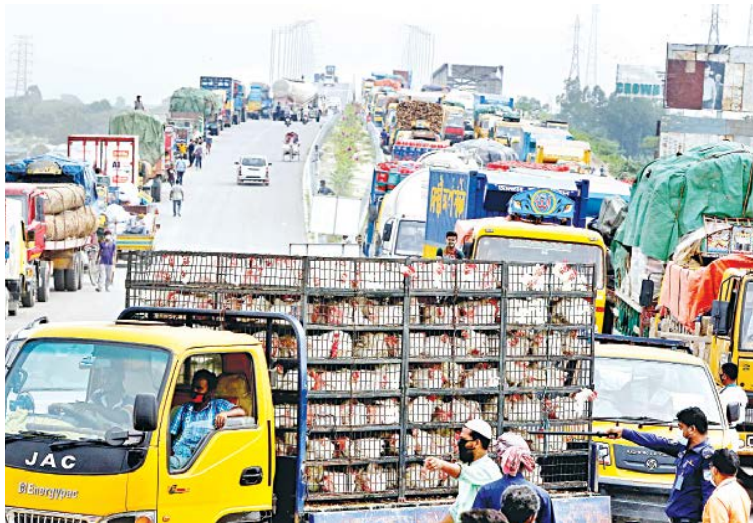
Vehicles are caught in long tailbacks on Dhaka-Mawa highway in Munshiganj's Kuchiamara area yesterday morning after police enforced a ban on entering and leaving Dhaka ahead of the Eid-ul-Fitr to contain the spread of Covid-19. Failing to move towards Mawa, a truck carrying poultry makes a U-turn.

UBER EATS TO WRAP UP BANGLADESH OPERATIONS B2