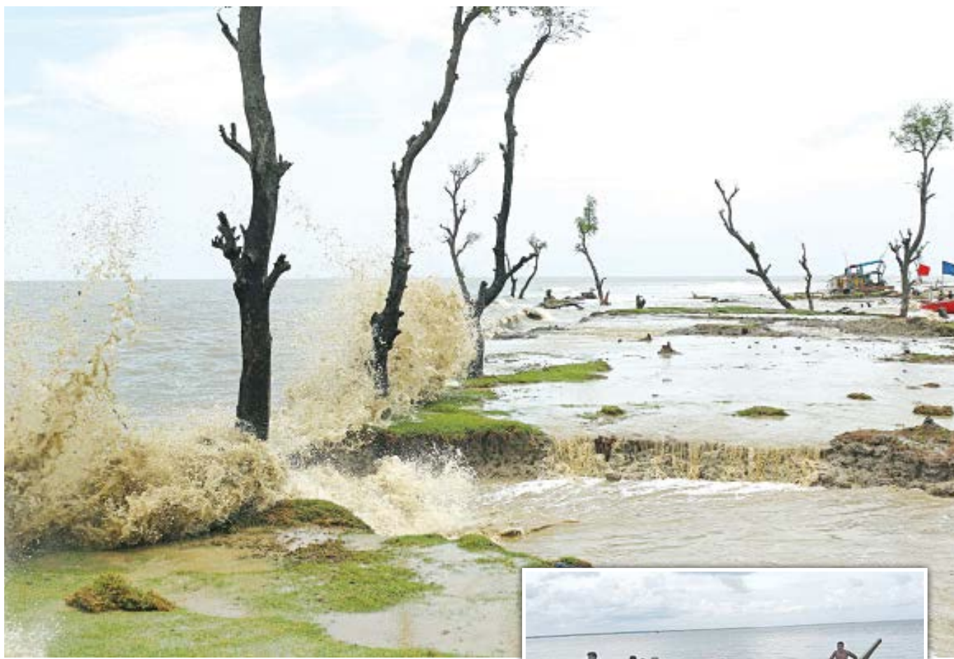
Waves crashing into the Patenga Beach in Chattogram yesterday as the country braces for cyclone Amphan. Inset, people from a char in Bholas Charfassion upazila are being taken to a cyclone shelter in the upazila town on a trawler.