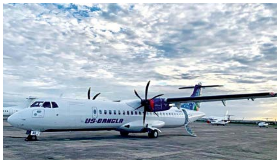
US Bangla was expected to receive two new ATRs by September 2020.