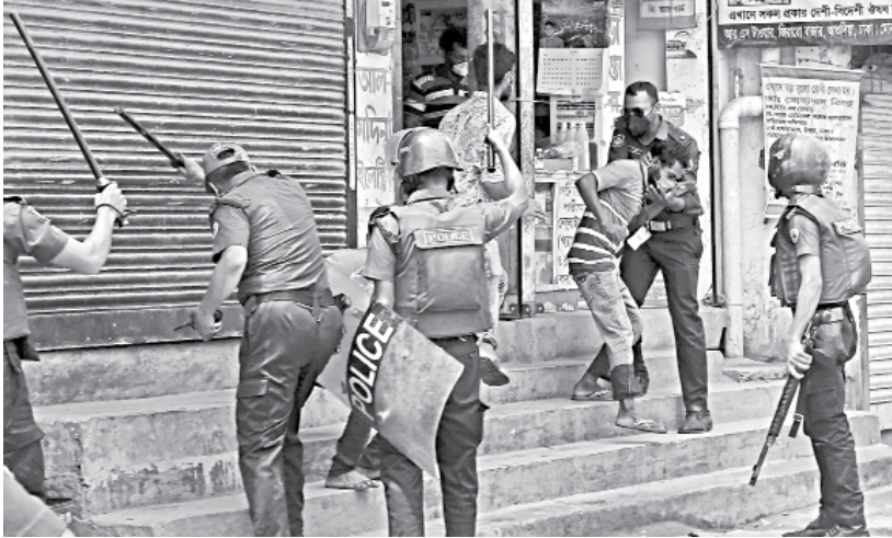
Police charge batons on demonstrating workers in Jirabo intersection.

Meanwhile, 100 workers of Sarker Steel Ltd in Dhamrai demonstrated in front of their factory demanding three