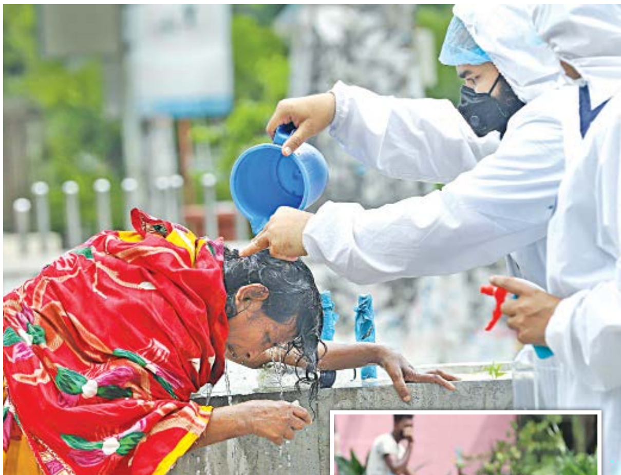
Policemen wearing personal protective equipment pouring water on an elderly woman's head after she collapsed in the middle of the road near Matsya Bhavan in the capital after walking in the scorching heat yesterday.