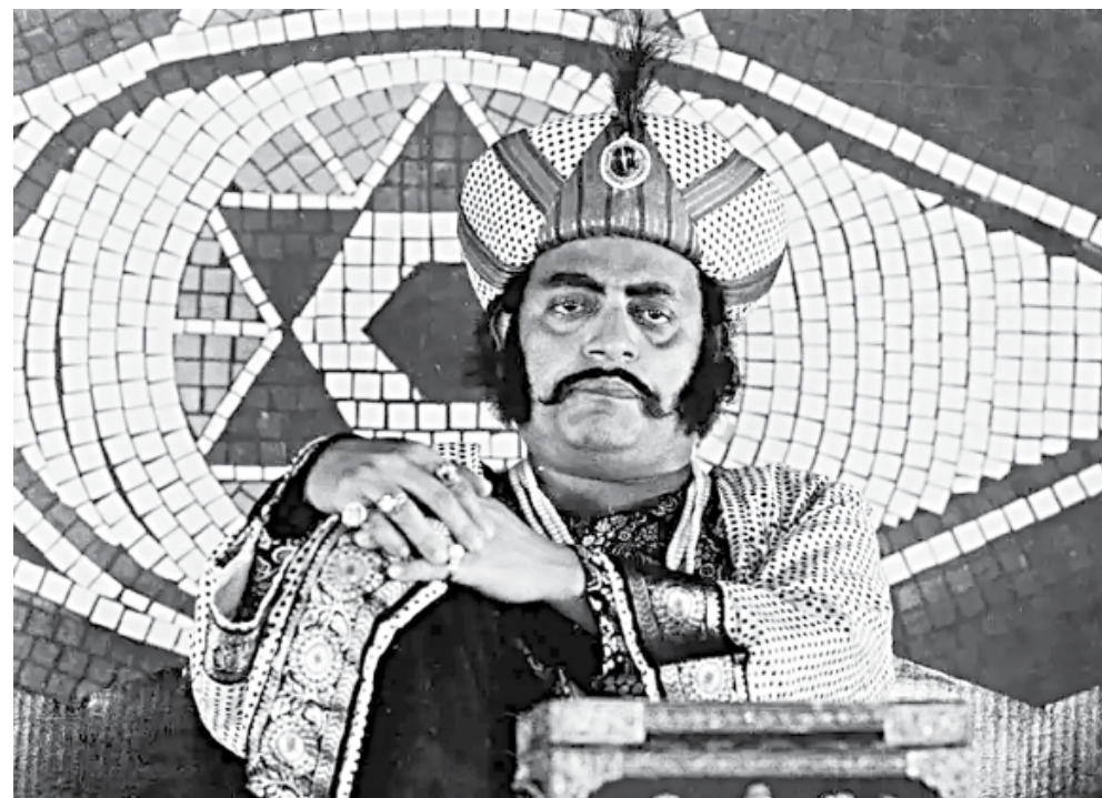
Still from Hirak Raajar Deshe .

characters' direct looks at the camera, internal monologue, voice-over narration, references to real events, use of symbols, imaginative use of sound and music etc to explore various social and cultural aspects of post-independence Bangladesh. Throughout Ghuddi , well-thought-out dialogues convey political critiques as well as artistic subtlety. In one scene, the internal monologue of the protagonist who was a freedom fighter becomes a sharp observation