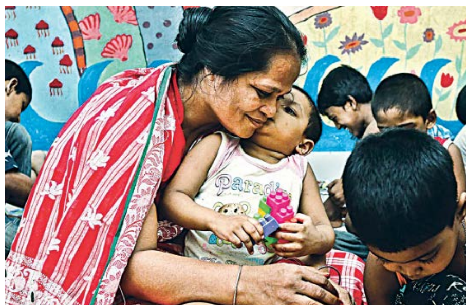
There can be no motherhood without work.

I also understand the absolute need to recognise that a good many stay-at-home mothers were simply never given the choice to have a career. But that does not mean we should refuse to grant due