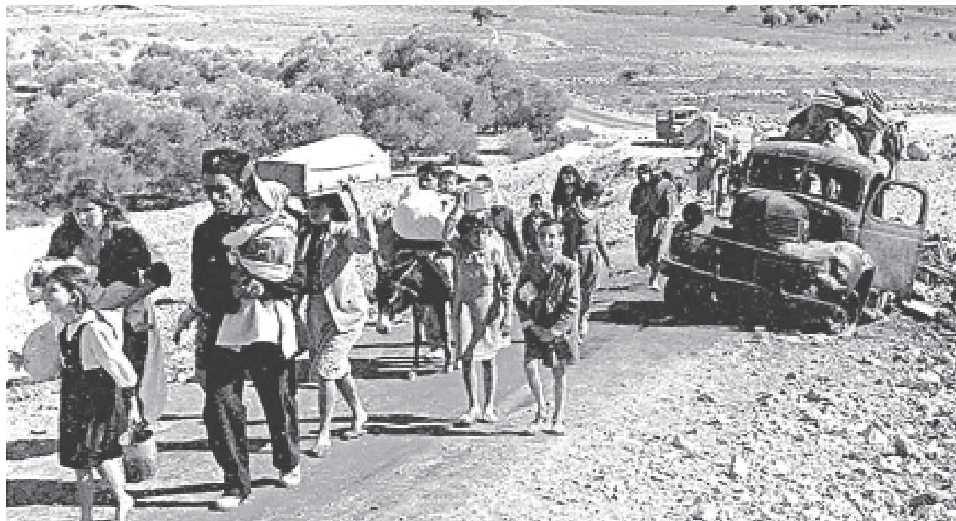
Palestinian refugees leaving the Galilee in October-November 1948.

indicted on corruption charges earlier this year, is the latest incarnation of this toxic mind-set. Sadly, he has sympathisers in the outside world as well. The powerful Zionist lobby ensures that. The most recent manifestation of that is the “dead on arrival” so-called Deal of the Century that validates aggression, illegal occupation and annexation coming out of the Trump administration. Even many Jews in Israel and outside laugh it off as a cruel joke. Bangladesh does not maintain any