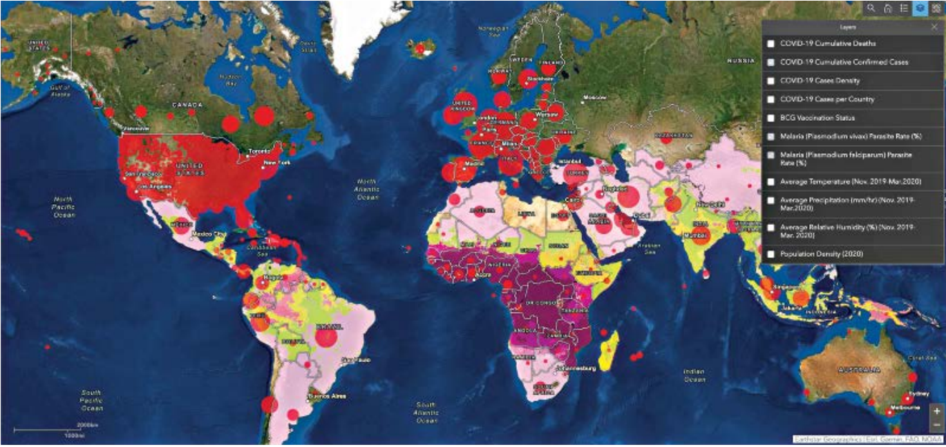
Bengal Institute Covid-19 dashboard showing all layers along with worldwide confirmed cases.

8, the dashboard has been attracting wide responses from all over the world. All critical criteria—from temperature to BCG vaccination—are overlaid on the global map. A comparative data on South Asian countries is also presented. Bengal Institute plans to add more relevant data and geographic and social information to the dashboard with a hope that the atlas may be helpful for strategising in mitigating this pandemic. For dealing with the impact of Covid-19 and future public health crises, a better integration of digital infrastructure associated with geo-spatial mapping and data collating should be a priority in our country. A Covid-19 tracking platform was very much needed for Bangladesh but now, thanks to the State Minister for ICT Division, a platform has been launched