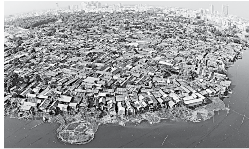
This aerial view of the Korail slum shows how difficult it would be to practice social distancing in such a congested area.