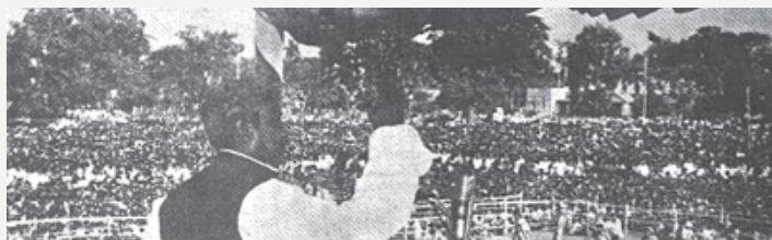
Bangabandhu addressing a large crowd at Rangpur Collectorate Maidan on May 11, 1972.