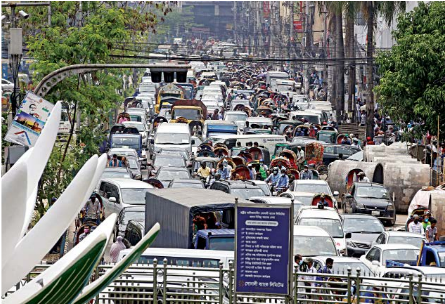
Scores of vehicles near Motijheel Shapla Chattar in the capital yesterday. The country is under a shutdown to slow the spread of Covid-19 and there are other restrictions in place. But people do not seem to care about social distancing there.