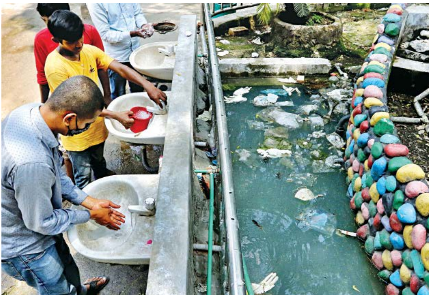
Discarded gloves and masks litter the dirty water at the base of the fountain near the burn unit of Dhaka Medical College Hospital. The fountain, meant for beautifying the premises, has become a repulsive sight and a possible breeding ground for Aedes mosquitoes. This paper published a photo of the fountain's sorry state last week but things have only become worse.