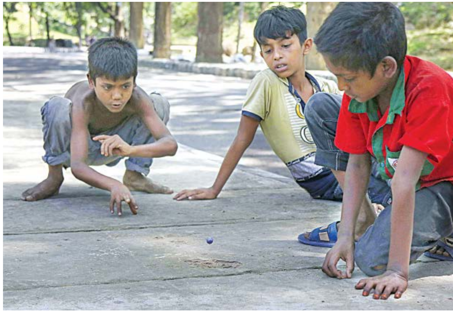
Children playing with marbles on the street while their parents are waiting for relief goods in Chattogram's CRB area yesterday afternoon. The suspension of the economy has rendered many people unemployed, and with the schools closed, students have found more leisure than ever.