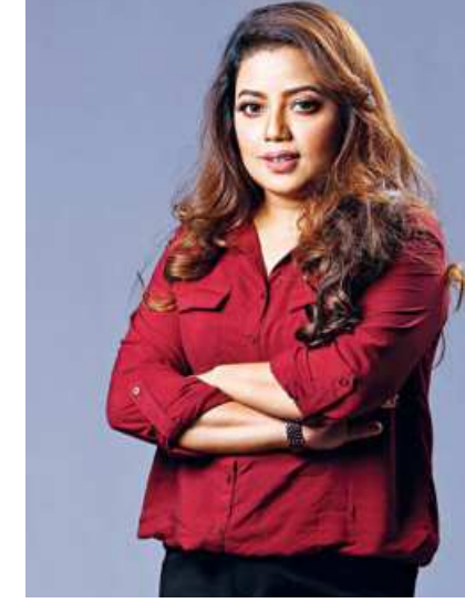
Pulling through as a musician

It was, perhaps inevitable for the music industry to see huge losses in the middle of the coronavirus pandemic. Since social gatherings can put one's well-being at risk right now, live shows have been cancelled, hindering the biggest source of income for musicians and putting their future in jeopardy.