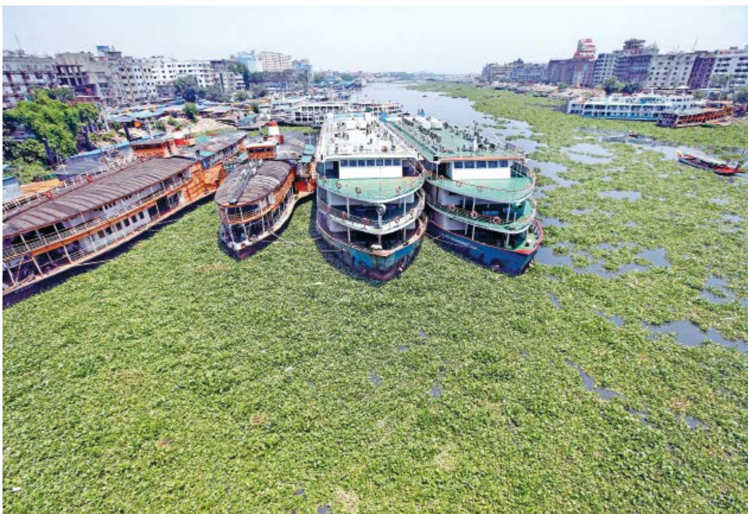
BIWTC steamers sit idle in the Buriganga at Shoari Ghat terminal in the capital yesterday as operation of passenger vessels remain suspended for an indefinite period since March 24 due to the Covid-19 outbreak.