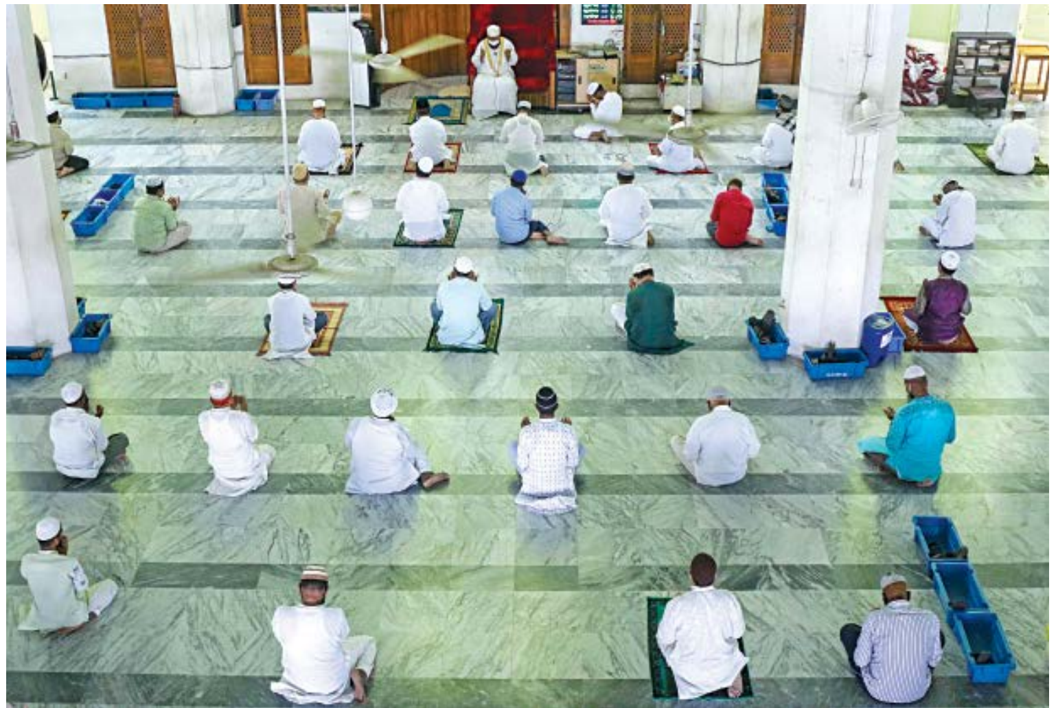
Wearing masks and maintaining social distancing, devotees offer Juma prayers at Jamiatul Falah Jame Masjid in Chattogram city yesterday, a day after the government withdrew a month-long partial restriction on offering prayers at mosques. The ban was imposed to slow the spread of coronavirus.