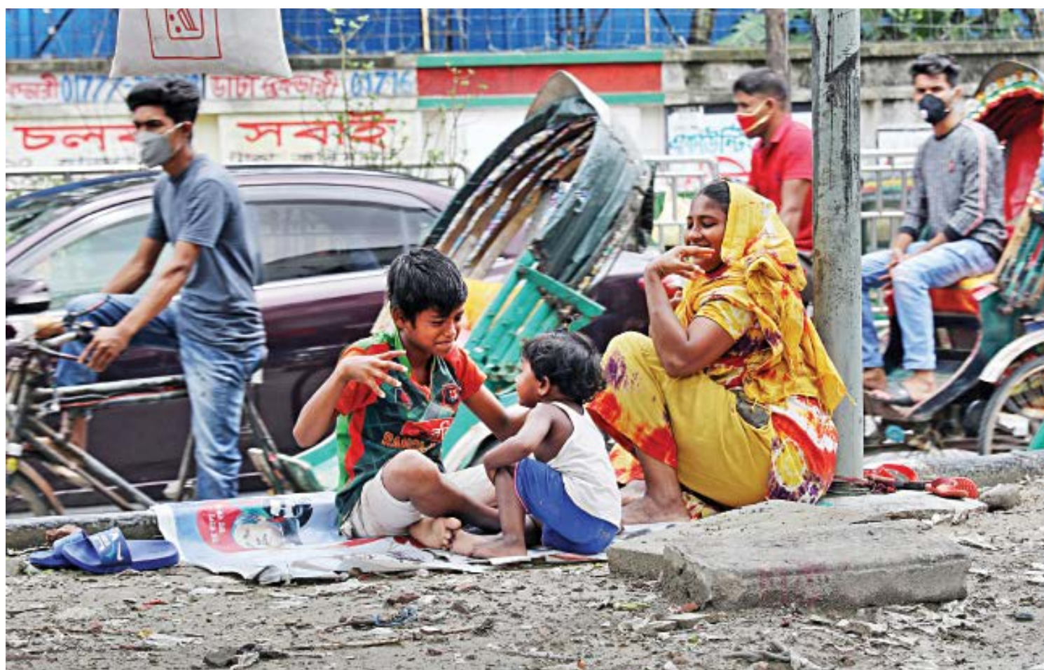
With nothing else to do, two siblings entertain each other to pass the time while their mother watches on with a smile on her face. Sitting on a divider, they were waiting for food to be distributed at the capital's Elephant Road. Even during times of crisis, it seems there are little pockets of happiness here and there.