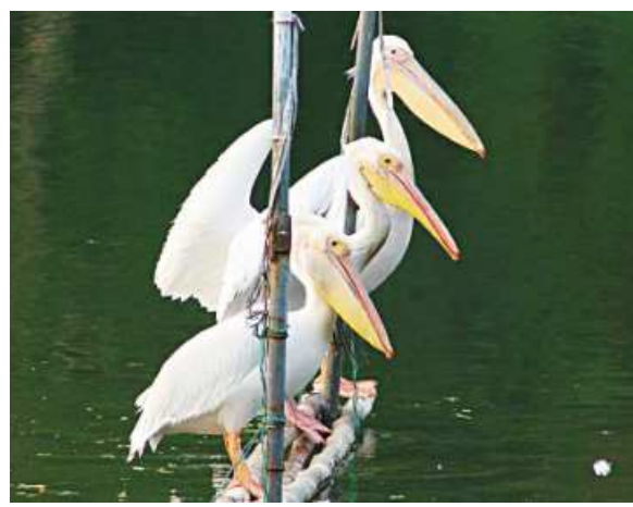
A tiger lazes around beside a little pond, not a care in the world. As crowds are absent from the national zoo, animals are spending a happier time. Giraffes spend their time among the greeneries, while more and more birds are spotted in the zoo premises. The photos were taken recently.