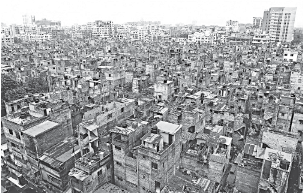
This aerial view of Geneva Camp shows how difficult social distancing can be in such a congested space.