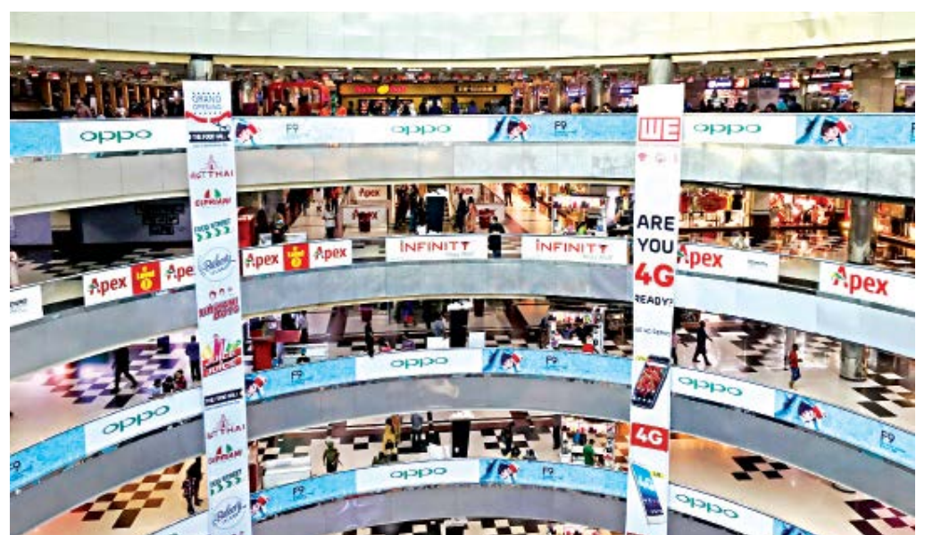
Shopping centres like Bashundhara City in the capital's Panthapath are set to open their doors again to capture Eid sales after remaining shut since March 26 to flatten the spread on coronavirus.

The commerce ministry also asked all shop owners and the Federation of Bangladesh Chambers of Commerce and Industry and other chambers to take measures in this regard.