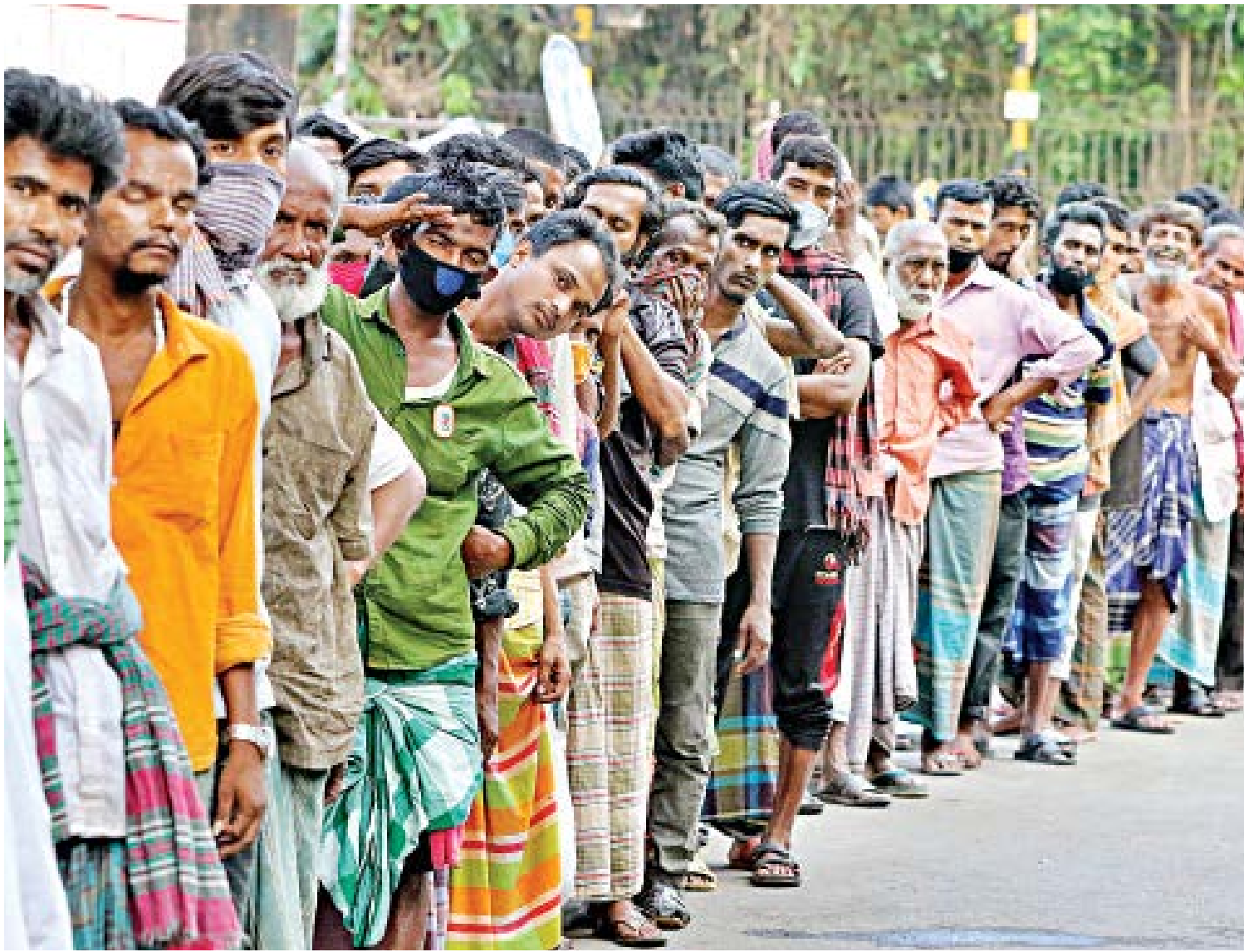
Social distancing protocols and the fear of being infected with Covid-19 are distant problems for countless people in the capital, who have no roof over their head, and now -- due to the nationwide shutdown -- no way to earn their bread. Men of various ages, most of them homeless and destitute, wait patiently in a congested yet disciplined queue for several hours near Doyel Chattar, knowing some samaritan will come along with food for them before iftar. The photo was taken yesterday.