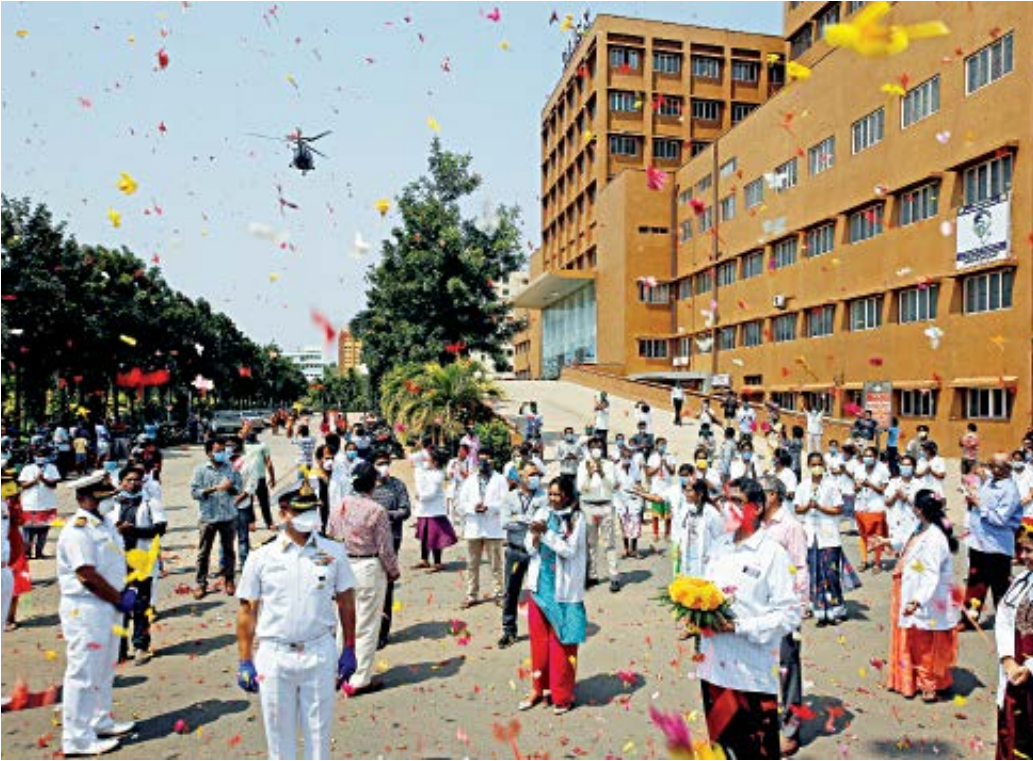
Indian Navy's Chetak helicopter shower flower petals in the premises of a hospital as part of an event to show gratitude towards the frontline warriors fighting the coronavirus disease (COVID-19) outbreak, in Visakhapatnam, India, yesterday.