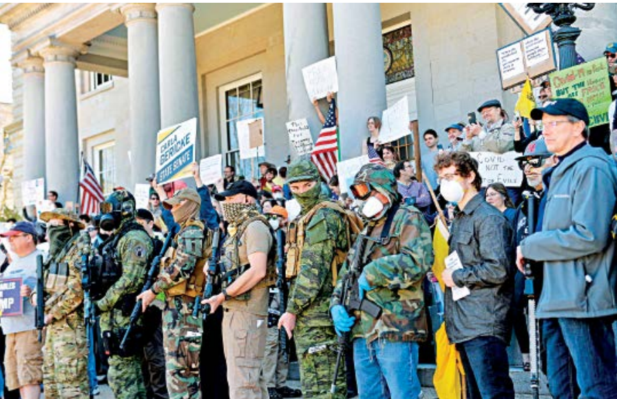
Armed protesters rally outside the New Hampshire State House calling for Governor Chris Sununu to open the US state, in Concord, Saturday.

Such restrictions have prompted riots in prisons in several countries, including Italy. In Argentina, prisoners rioted last month demanding some inmates be freed due to fears of infection.