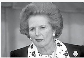
MARGARET THATCHER ELECTED PRIME MINISTER OF BRITAIN