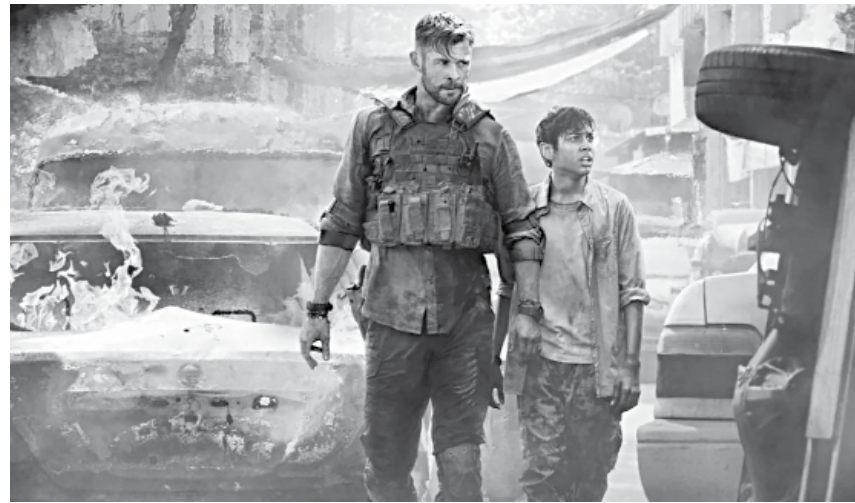
A still from the movie 'Extraction'.