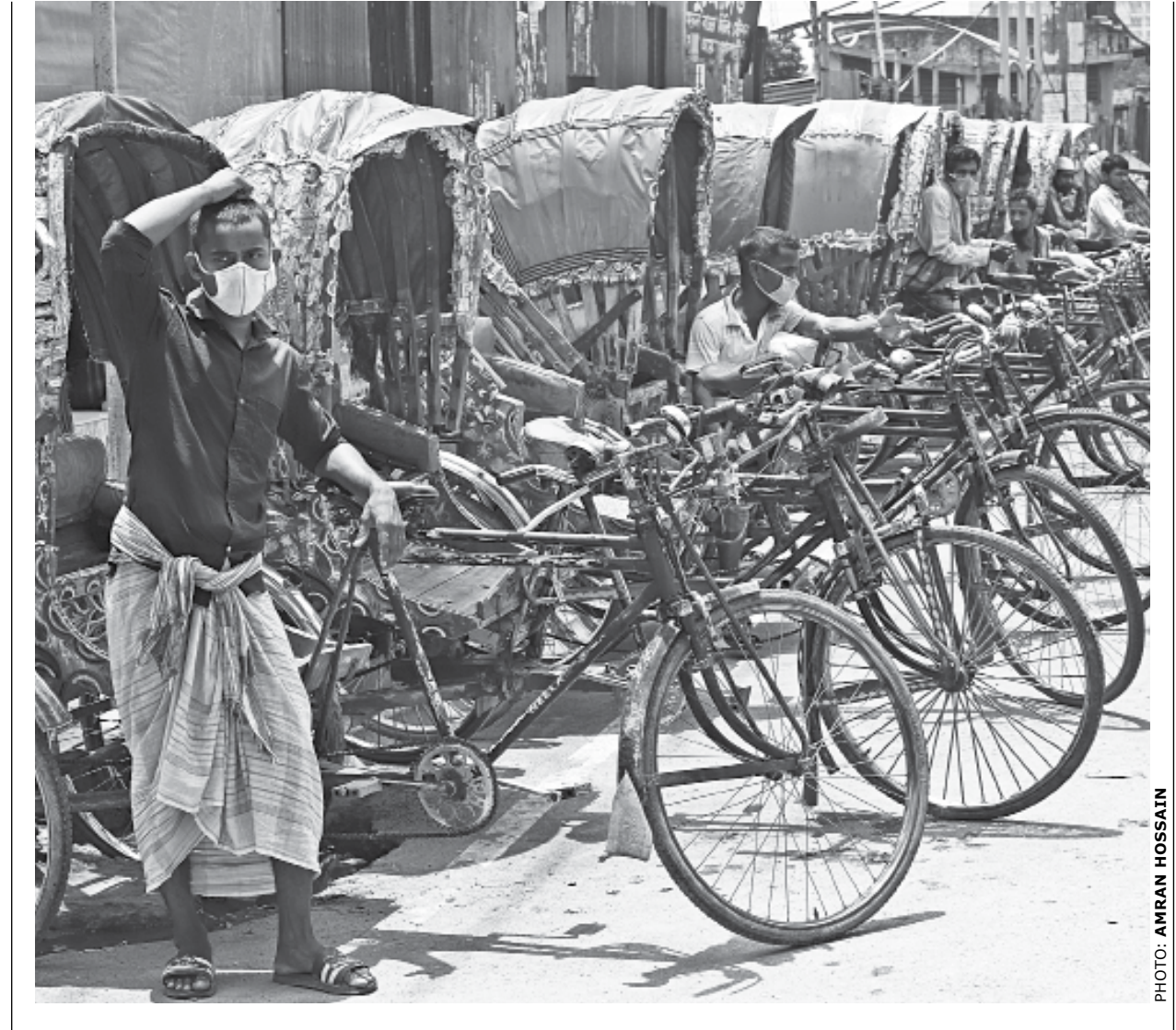
A long row of rickshaws parked on the side of a road in Badda recently. With the countrywide shutdown in place to contain the spread of Covid-19, survival has become quite an uphill battle for most rickshaw-pullers. Keeping that in mind, law enforcers have allowed them to wait for passengers in the area this way by maintaining distance.

Two Rab men were injured in the "gunfight", the Rab official said.