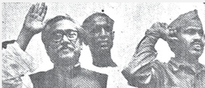
Bangabandhu inspecting the Lalbahini in front of Gonobhaban on May 1, 1972.