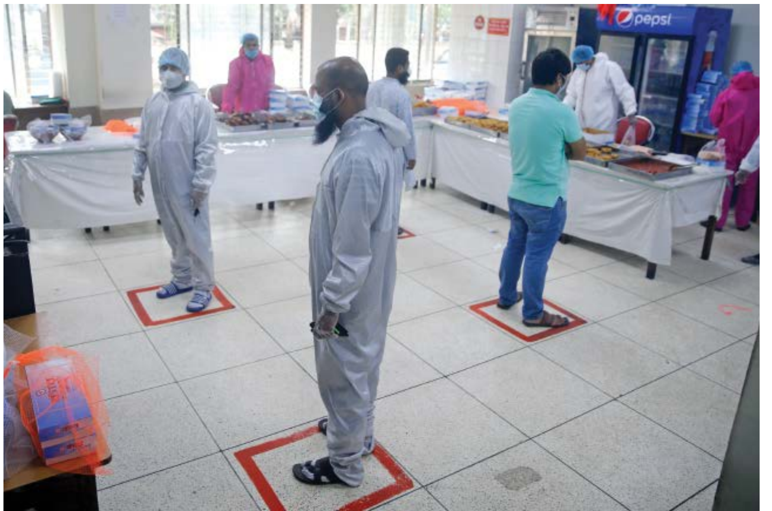
Four customers, two of them in personal protective equipment, stand on marked spots to get take out iftar items at Star restaurant on Dhanmondi-2 in the capital yesterday. Sales of iftar items at the popular restaurants have started after the authorities announced that takeaways would be allowed.