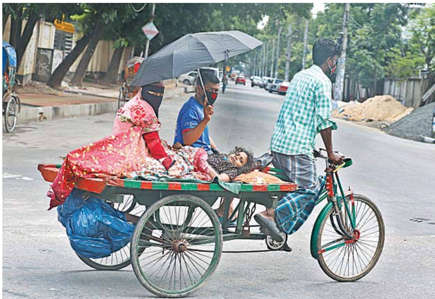
A woman is being taken to hospital by a rickshaw-van on an otherwise empty Old Elephant Road in the capital. As the income of poor people falls significantly, those needing medical attention have become particularly vulnerable. The photo was taken yesterday.