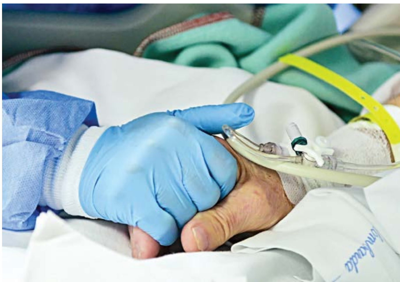
Keeping faith in humans and restoring confidence in them are equally urgent in reproducing social resilience.

There is no denying the fact that a dubious business-political nexus, involved in money laundering, exists in the country. The government needs to keep a close eye on this more than ever. Indeed, a part of the laundered money in